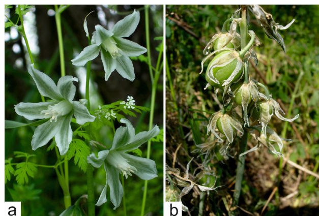
Fig. 2. Ornithogalum boucheanum near Zmajevac on Bansko Hill: a) flowers and b) fruits (Photo: J. Csiky and D. Purger).

O. boucheanum rarely occurs in Southern Transdanubia (Hungary), in grasslands (Purger 2008) and spring weed vegetation in vineyards (Pál 2007); in this part of the coun-