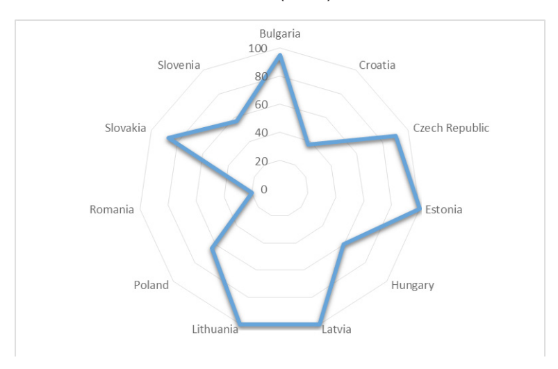
Figure 4: Percentage of gas imports from Russia in total gas imports for the studied EU member states (2012)