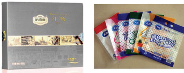
Fig. 1 – Green environment-friendly materials (left) and environmentally unfriendly materials (right)

Using renewable materials is one of the important ways of protecting the environment. 11 Renewable materials such as bamboo and wood have certain reusability. In packaging material design, the application of renewable materials can achieve unexpected effects. For example, waterproof and heat-resistant packaging materials can be made based on the physical properties of wood pulp during the manufacture of paper tableware.