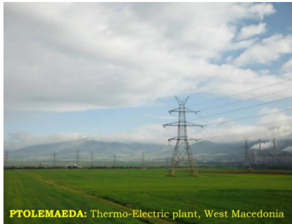
Figure 2: Site of production & transfer

In the “case of Greece”, an example of coexistence of an electricity production plant and the national high voltage grid is one of the four thermoelectric plants in the region of