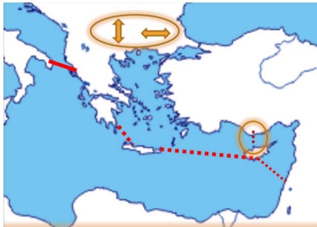
Figure 9: Cross-border connections

in “Means and Method” for Protection of this Critical Energy Infrastructure. Technical means, like thermo sensors dispersed over remote areas will give early warning for new fires. Real time IR Satellite images, and drones, will also provide valuable information to the “Disaster Management Centers” for quick reaction and coordination. Personnel well trained would also provide Protection in order to prevent or timely restore the damages to the grid. Personnel with special skills and training are required in order to maintain or restore damages on electricity grid, especially the high voltage lines in remote areas or on sea bed for submersible electricity lines. In order just to clarify responsibilities between the two (2) organizations, ΑΔΜΗΕ transfers the electricity until the outskirts of inhabitant areas and ΔΕΔΔΗΕ downgrades the voltage and distributes to the customers (consumers).