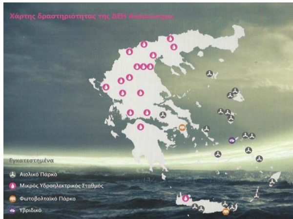
Figure 4: Secondary and Renewal sites

Thermoelectric plants which use fuel other than coal, such as oil or gas, operate two in Attica region and three on the island of Crete.