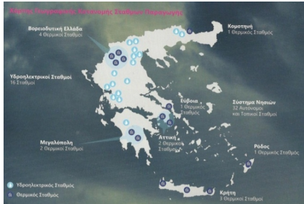
Figure 3: Main production sites

Ptolemaeda in Northern Greece / Western Macedonia area. The proximity of the plant with the dense high voltage transfer network, in a limited specific geographical area, creates special conditions and high requirements for protection of the whole local system.