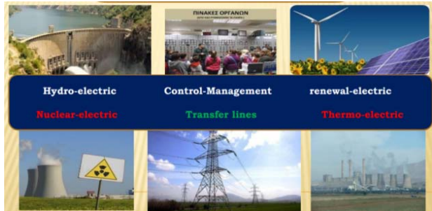
Figure 1: Electricity production & transfer

11 Dec. 2009 and in the EU Internal Security Strategy 5 .