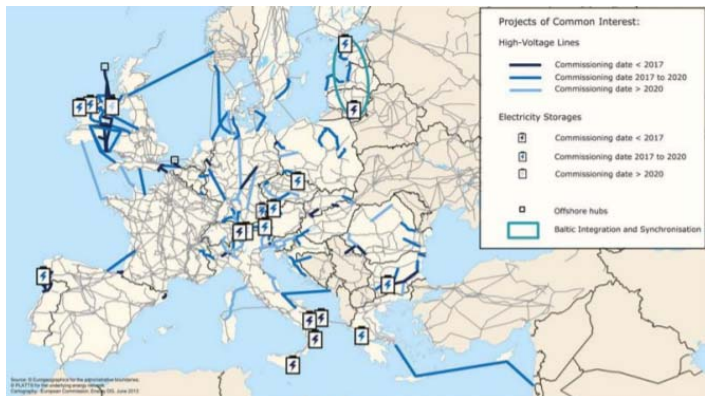
Figure 8: Submersible cables (HVDC lines)

During the big fires in Greece in the summer of 2007, there were rumors and some evidence, but not clear proofs, that it was sabotage or terrorist action. Remarkable was the fact that the fire destroyed an extensive national electricity grid, affecting four main production plants, namely: the thermoelectric at Aliveri , the hydroelectric on Ladonas river and two thermoelectric plants at Megalopolis area. As it is obvious on the satellite image, all fires started close to the main production plants. After this disaster, an enormous effort was required to restore damages, in an extensive part of the electric national grid.