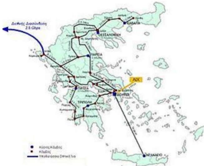
Figure 5: National electricity grid

In 2016, an agreement for “Strategic Partnership” was signed between the Greek Public Electric Power Corporation known as PPC , with its nationally trade mark name ΔΕΗ(pronunciation=dei) and the China Machinery Engineering Corporation ( CMEC ), that is a construction and engineering company, forming one part of the China National Machinery Industry Corporation group of companies. The specialization of CMEC lies in construction of power projects in generation, transmission, and distribution.