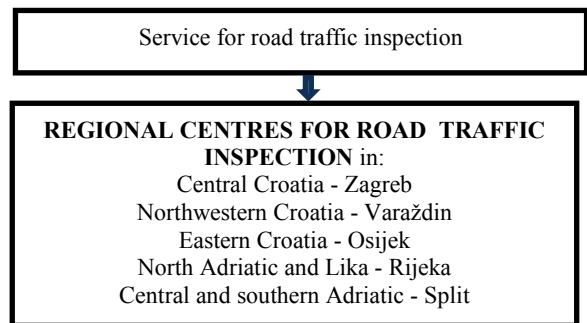
Figure 3 The model of regionalization for road traffic inspection in Croatia