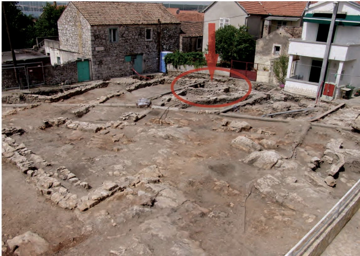
Sl. 4. Biograd na Moru, Narodni trg (Trg Brce).

Fig. 4. Biograd na Moru, People's Square (Narodni trg, Trg Brce).