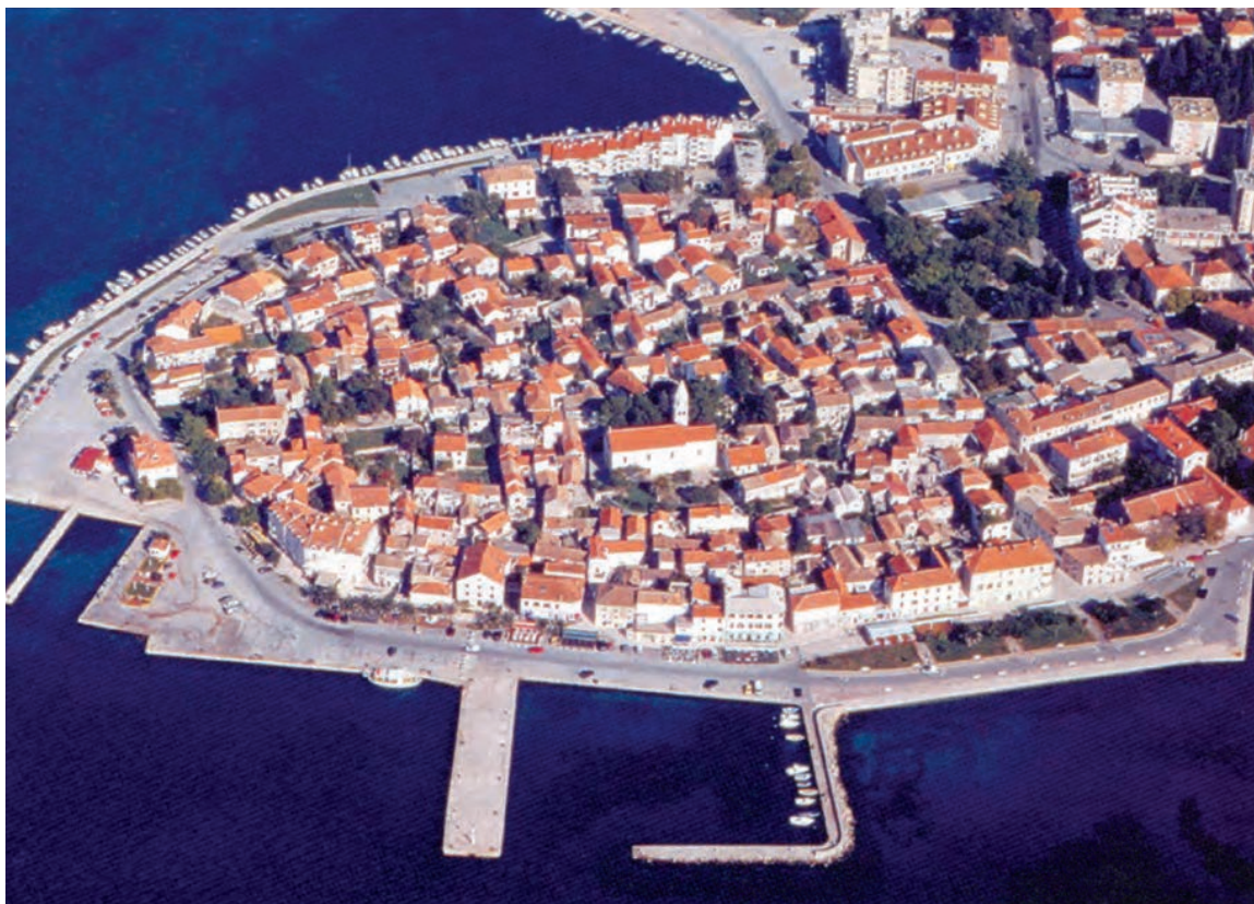
Sl. 1. Biograd na Moru, zračni snimak