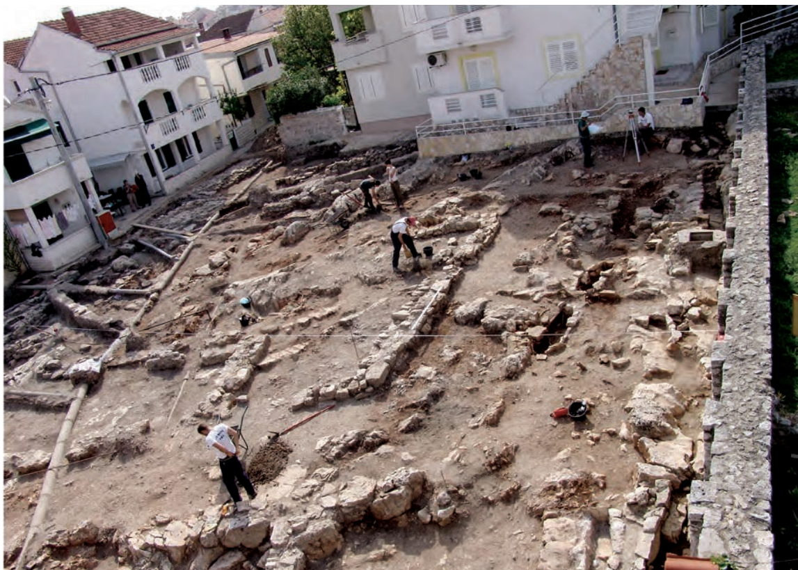
Sl. 3. Biograd na Moru, Narodni trg (Trg Brce). Fig. 3. Biograd na Moru, People's Square (Trg Brce).

Radi se o graditeljskim objektima koji su služili za stanovanje i druge svrhe. Objekti se razlikuju, oblikom, veličinom, kao i fazama izgradnje. Visina zidova je od 10 cm do 1 m. Veličinom se izdvaja jedna građevina dužine 14,5 m, a širine 3,5 m. Zidovi su građeni od manje ili više obrađenog kamena, neujednačene veličine i vezani su žbukom. Temelji im leže izravno na živcu. Mjestimiце se nailazilo na ostatke podnica od nabijene zemlje ili loše žbuke, kao i kamenih ploča. Na nekoliko mjesta se naišlo i na slojeve