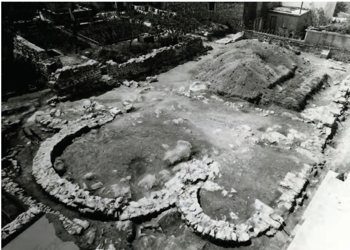
Sl. 2. Bazilika sv. Ivana Evanđeliste, arheološka istraživanja prof. J. Beloševića 1969. i 1970. godine.

Fig. 2. Basilica of St. John the Evangelist, archaeological excavations led by prof. J. Belošević in 1969 and 1970.