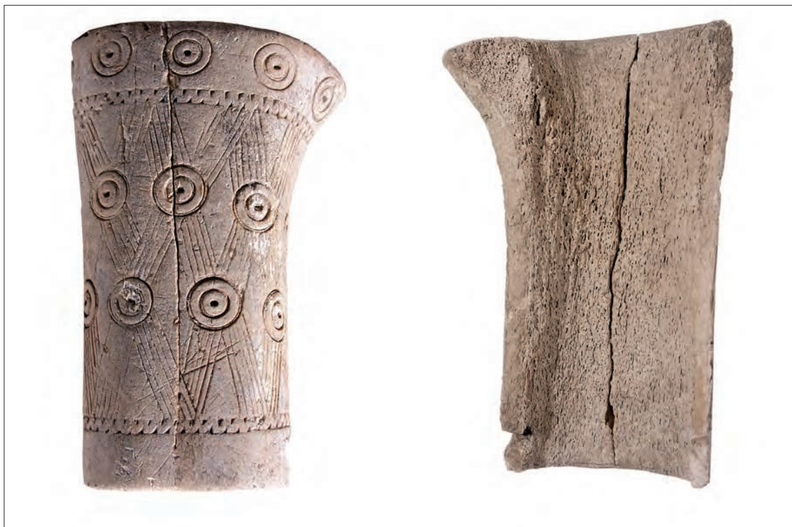
Sl. 5. Biograd na Moru, Narodni trg. Koštani tuljac. Fig. 5. Biograd na Moru, People's Square. Bone tube.

grobljima s poganskim, nego u grobljima s kršćanskim značajkama pokapanja na spomenutom teritoriju. Koštani tuljci dosad su otkriveni u grobovima na Gorici u Stranču 10 (tri primjerka), na Goričini u