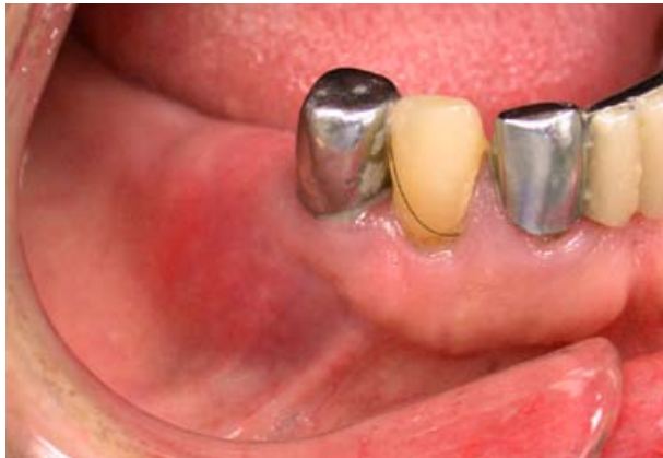
Slika 1. Klinička slika desne strane mandibule s laganom oteklinom u bezubom području, posteriorno na prvom pretkutnjaku.