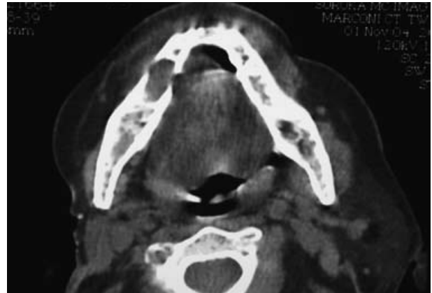
Slika 2. Aksijalna CT-snimka prikazuje osteolitičnu koštanu leziju s dobro definiranim rubovima - zahvaćaju desnu stranu korpusa mandibule.