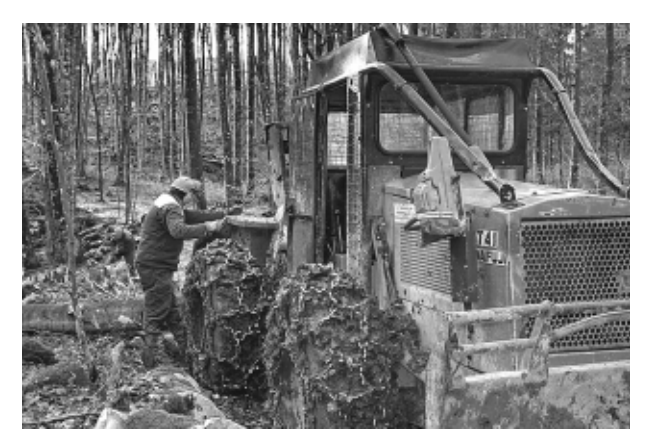
Fig. 2 Group work with skidder IWAFUJI-T41 Slika 2. Rad skupine sa skiderom IWAFUJI-T41

compartments with sanitation cut (subjects 8 and 9). The compartment surface ranged from 32 ha to 66 ha; however the research comprised only a part of these surfaces.