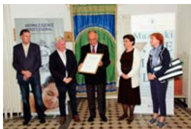
5. Exhibition opening at the Faculty of Pharmacy and Biochemistry of the University of Zagreb.