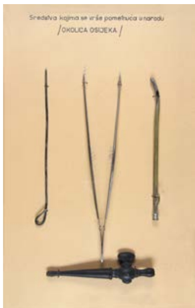
6. Folk abortion instruments, Osijek surroundings, 1942, HMMF-564 (Photo: Goran Kos).