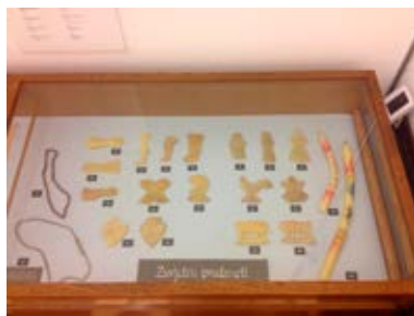
3. Showcase with votives.