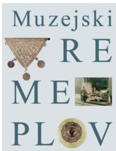
1. Visual identity of the exhibition, Scan (Design: Ante Rašić, Studio Rašić).