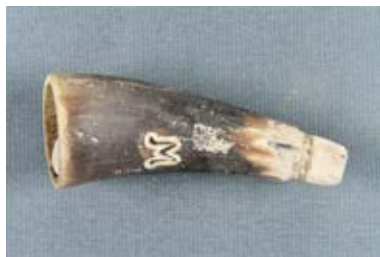
9. Blood drawing horn, HMMF-458.