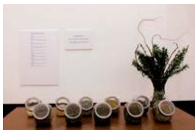
4. Interactive part of the exhibition with herbal teas.