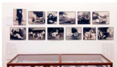
2. Central part of the exhibition display.

The exhibition Museum Time Machine: The Collection of Folk Medicine as the Core of the Exhibition Display of the First Croatian Museum of Medicine was the second study exhibition mounted by the Croatian Museum of Medicine and Pharmacy of the Croatian Academy of Sciences and Arts. 1 Since the Museum still has no exhibition premises of its own, the exhibition was held at the Palace of the Croatian Academy of Sciences and Arts, in the Strossmayer Gallery of Old Masters. The intended duration was from 12 th April to 31 st May 2017; however, due to great interest among the public, the exhibition was extended until 31 st August. After the exhibition had been closed at the Strossmayer Gallery of Old Masters, it was moved – thanks to close cooperation with the Faculty of Pharmacy and Biochemistry of the University of Zagreb – to the Faculty on 13 th September 2017, where it remained open for the public until 29 th September.