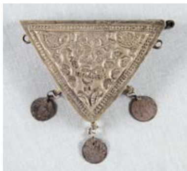
10. Box for inscriptions against diseases and spells, HMMF-521 (Photo: Goran Kos).