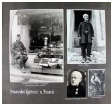
8. Folk healers in Bosnia, exhibition board with photographs, HMMF-520.

The exhibition was realised thanks to the support of the City Office for Education, Culture and Sports of the City of Zagreb; the Croatian Medical Association; and the Foundation of the Croatian Academy of Sciences and Arts.