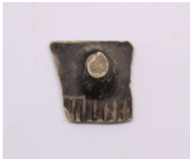
Fig. 7. Fragment of skyphos, AMS 56545

Sl. 6. Ulomak skifa, AMS 56447