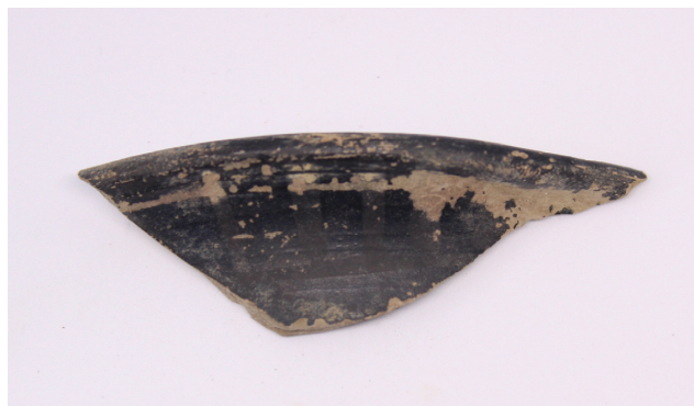
Fig. 10. Fragment of jug/oinochoe, AMS 56445

Sl. 10. Ulomak vrča/enohoje, AMS 56445