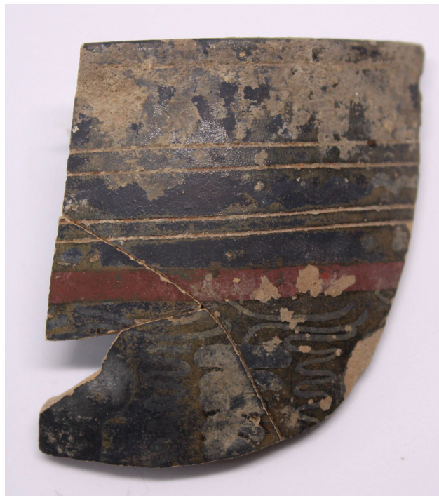
Fig. 5. Fragment of skyphos, AMS 56496

The best preserved jug from Palagruža also belongs to the Oreb Collection. It is part of a belly of a larger vessel, and because other parts are missing it is difficult to distinguish whether it is an oinochoe or pelike. It has wide and shallow ribs and the coating is not of the best quality. It ranges from black-greyish to reddish. It is noted that coatings on vessels during the Hellenistic period deteriorated and can have different colours. 19 They can be fired in red, grey and brown, and sometimes, as it is on this sherd from Palagruža, several colours and their shades can occur on the same vessel. Among small Gnathia potsherds on Palagruža, to identify oinochoe or pelike or other shapes of larger vessels, one can only depend on the thickness of the walls, as it is the sherd of lower part of a vessel (Fig. 3, lowest on the left), or on rims. One rim with a good black coating from trench V-6 with traces of painted decoration was probably part of a trefoil mouth (Fig. 10). As in the case of skyphoi, the pelike and oinochoe are very common shapes in Gnathia production, and