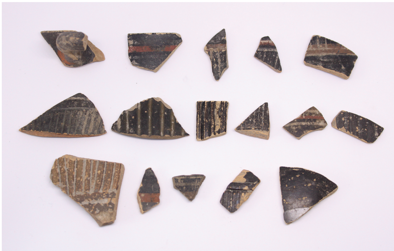
Fig. 3. Sherds of Gnathia ware from Palagruža (photo: V. Barbarić) Sl. 3. Ulomci keramike tipa Gnathia (foto: V. Barbarić)

keepers and now are kept in private collections. The largest private collection belongs to Jadranko Oreb from Vela Luka on the island of Korčula and the smaller collection is kept in the lighthouse on Palagruža. All unearthed Gnathia potsherds during the excavation campaigns in 1990s and 2000s are stored in the Archaeological Museum in Split (hereafter AMS).