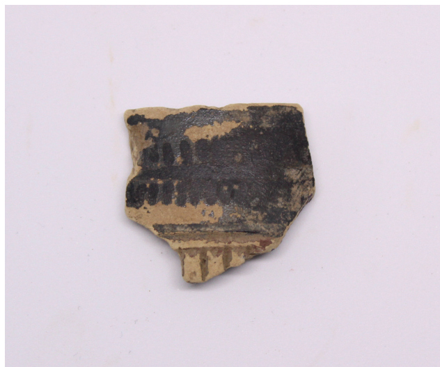
Fig. 6. Fragment of skyphos, AMS 56447

Sl. 6. Ulomak skifa, AMS 56447