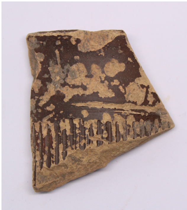
Fig. 8. Fragment of skyphos, AMS 56434

Sl. 8. Ulomak skifa, AMS 56434