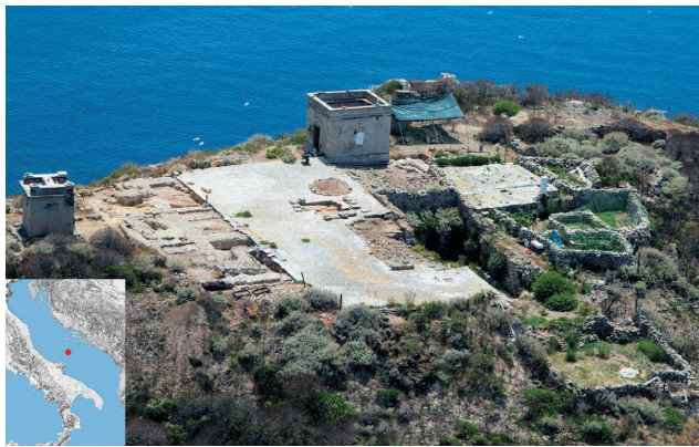
Fig. 1. Aerial photo of Salamandrija Sl. 1. Zračna snimka Salamandrije

for ship extraction. It is exposed to strong winds and has no spring water. These extreme conditions make any permanent occupation on the island very difficult without organised help from mainland in water and food supply. However, the geographical position, in the middle of the Adriatic, made Palagruža an important point on maritime sailing routes.