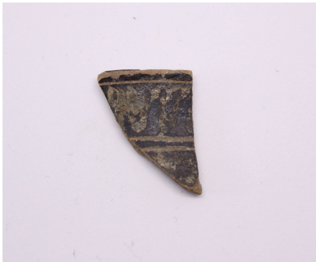
Fig. 4. Fragment of skyphos, AMS 56529

Sl. 4. Ulomak skifa, AMS 56529