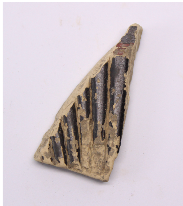
Fig. 11. Fragment of plate, AMS 56600

Regarding the coatings on the preserved Gnathia sherds, they are mostly black and some of them even very lustrous. Certain sherds have reddish and greyish coatings, as the above mentioned jug from the Oreb Collection, and some have brown, as the skyphos from trench V-7 (Fig. 8). The variety of colours is not uncommon on Hellenistic ware, when quality of the coating is not proficiently achieved as it was on the Attic ware of the Classical period. 25 However, the brown coating on above mentioned skyphoi and the sherds of what was likely an oinochoe (Fig. 3, lowest on the left) deserves some more attention. This colour of the coating was uncommon in southern Italy, but it is well known on the Hellenistic vessels in north-western Greece and on vessels assumed to belong to Dalmatian workshops, most likely to Issa, that are dated in the 2 nd c. BC. 26 So, the sherds with brown coating could be attributed to the Issaeon Gnathia ware. The