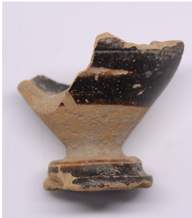
Fig. 9. Fragment of skyphos, AMS 56700

production. 20 However, the rim of skyphos from trench Z-7 from Palagruža is too small for any precise attribution (Fig. 4). On a skyphos from the same trench are painted hanging grapes, tendrils, and a red ribbon (Fig. 5). This motif is one of the main characteristics of the Knudsen group produced in the late 4 th and early 3 rd c. BC. The workshop of the Knudsen group is assumed to be in Daunia, although could have been produced in Peucetia as well. 21 The palm branches, “toothed saw” and simple horizontal red and white lines are, beside shape and ribbing, the most common features of the Apulian Gnathia production. These motifs are regularly found on the Late Canosan group dated in the late 3 rd c. BC. 22 Potsherds with the figural depiction/scene of the first phase of the Apulian Gnathia production were not found on Palagruža. So, most sherds of Gnathia ware from Palagruža belong to middle and late Apulian Gnathia dated at the end of 4 th and in 3 rd c. BC. Their provenance has to be sought in the workshops in the northern and central Apulia. This is not unusual since there are numerous sites on the east Adriatic coast with imported Gnathia ware