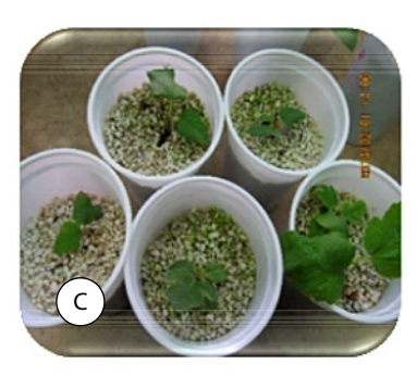
Figure 2. Ex-vitro rooting of 'Bargchenari'; A - three months after transfer to soil, B - two month after transfer to perlite + peat, C - two months after transfer to perlite.

After two months, the percentage of plant survival decreased to 66.67% in perlite medium. The maximum length of shoots (4.37 cm) was gained in the peat + perlite medium, which was significantly higher than those in perlite medium (1.22 cm). The number of leaves was also higher in the peat + perlite (5.33) medium than in perlite (3) but there were no statistically significant differences between them. Figure 2 shows plants adapted to different soil mixtures.