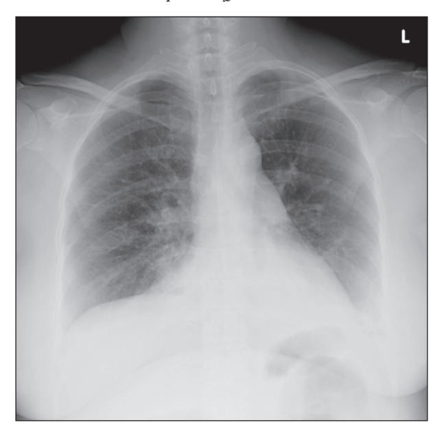
Fig. 2. Follow up radiograph: resolved pulmonary edema 24 hours after therapy.

The immediate treatment consisted of oxygen (4 L/min by nasal catheter), 40 mg of furosemide intravenously, and low molecular weight heparin prophylaxis. Diuretic therapy was continued for the next 24 hours until the total urine output reached 5500 mL. Two days later, clinical and laboratory findings were normal, and chest x-ray showed complete resolution of pulmonary edema. Oxygen saturation was 96% on room air, and the patient was discharged from the hospital.