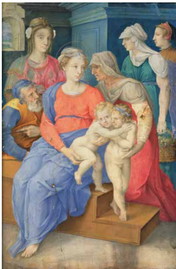
3. Giulio Clovio, The Holy Family with St Elisabeth, St John the Baptist, and Three Noble Ladies, second half of the 1550s, tempera on vellum, Musée Marmottan, Paris, Inv. No. M 6121

Julije Klović, Sveta obitelj sa sv. Elizabetom, sv. Ivanom Krstiteljem i trima plemkinjama, druga polovica 1550-ih, tempera na pergamentu, Musée Marmottan u Parizu, Inv. No. M 6121