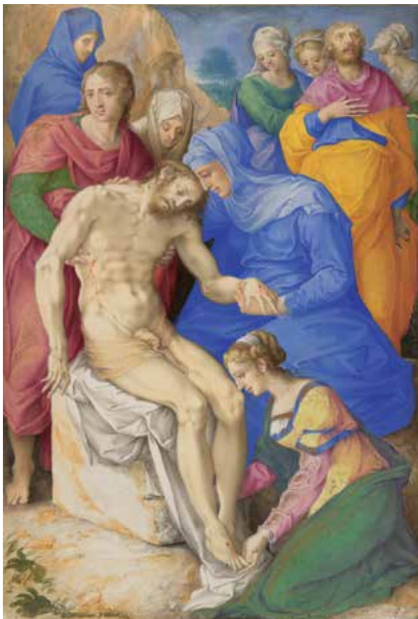
7. Giulio Clovio, The Lamentation, ca. 1550, gouache enhanced with gold on vellum, 21.6 × 14.5 cm, National Gallery of Art, Washington, Patrons' Permanent Fund, Inv. No. 2006.111.1

Julije Klović, Oplakivanje, oko 1550., gvaš oplemenjen pozlatom na pergamentu, 21,6 × 14,5 cm, National Gallery of Art, Washington, Patrons' Permanent Fund, Inv. No. 2006.111.1