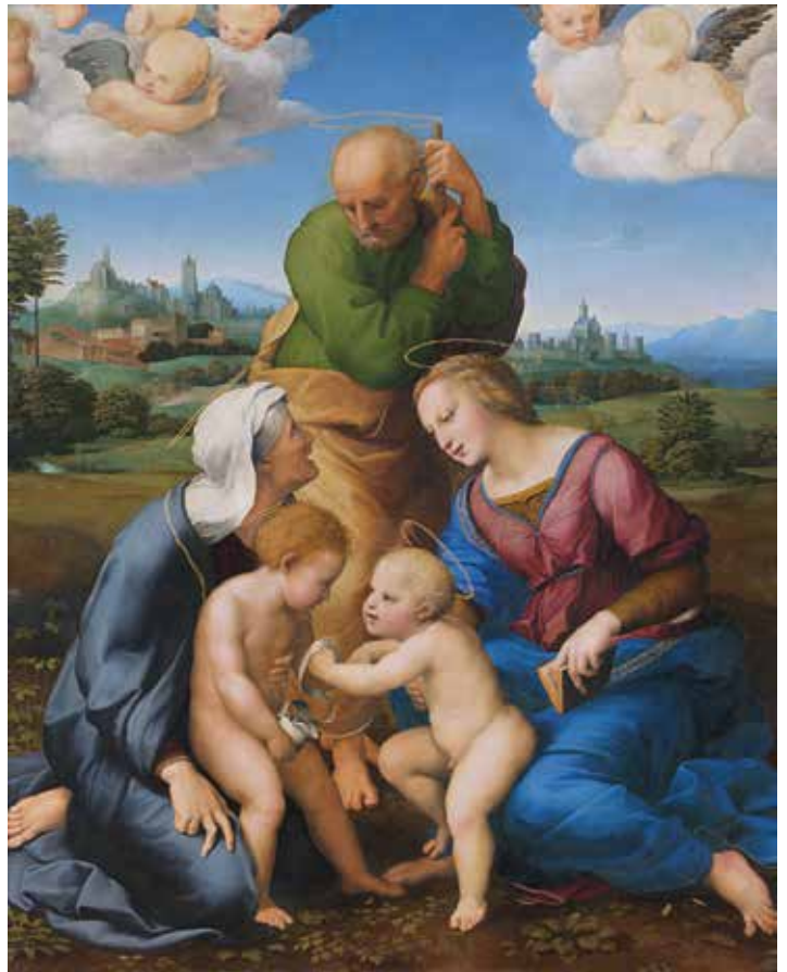
6. Raphael, The Canigiani Family , 1507, oil on panel, 131 × 107 cm, Alte Pinakothek, Munich, Inv. No. 476

Julije Klović, Sveta obitelj sa svecima, nedatirano, gvaš na slonovači, 19,6 × 14,3 cm, nepoznata lokacija