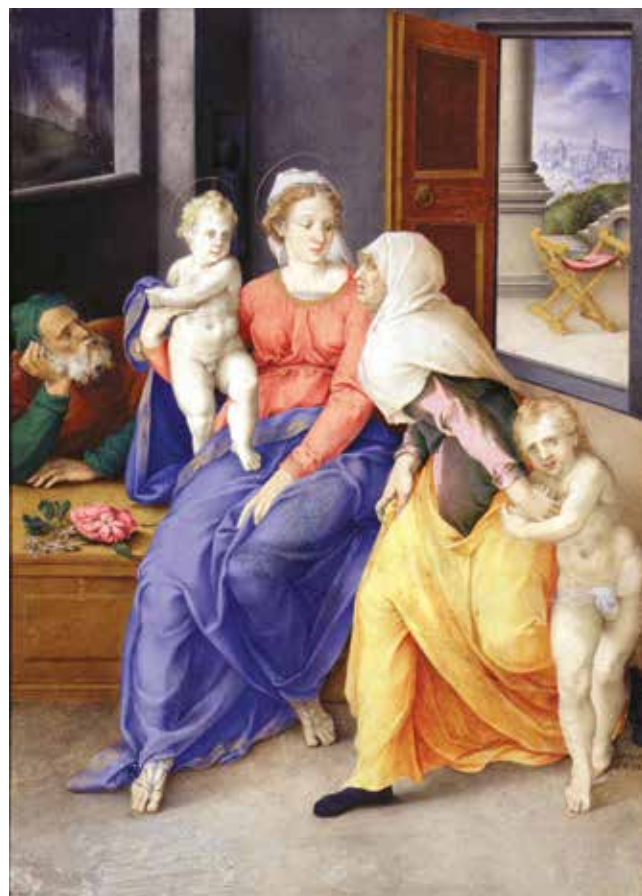
4. Giulio Clovio, The Holy Family with St Elisabeth and St John the Baptist, 1556/57, tempera and gold on vellum, 24 × 17.3 cm, Museo Lázaro Galdiano, Madrid, Inv. No. 540

Julije Klović, Sveta obitelj sa sv. Elizabetom, sv. Ivanom Krstiteljem i trima plemkinjama, druga polovica 1550-ih, tempera na pergamentu, Musée Marmottan u Parizu, Inv. No. M 6121