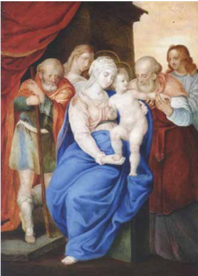
5. Giulio Clovio, The Holy Family with Saints , undated, gouache on ivory, 19.6 × 14.3 cm, unknown location

Julije Klović, Sveta obitelj sa svecima, nedatirano, gvaš na slonovači, 19,6 × 14,3 cm, nepoznata lokacija