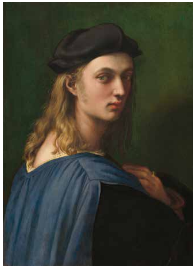
8. Raphael, Bindo Altoviti, ca. 1515, oil on panel, 59.7 × 43.8 cm, National Gallery of Art, Washington, Samuel H. Kress Collection, Inv. No. 1943.4.33

Julije Klović, Oplakivanje, oko 1550., gvaš oplemenjen pozlatom na pergamentu, 21,6 × 14,5 cm, National Gallery of Art, Washington, Patrons' Permanent Fund, Inv. No. 2006.111.1