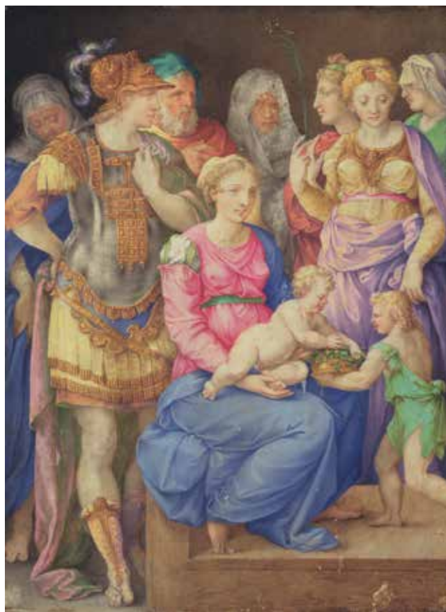
2. Giulio Clovio, The Holy Family with a Man in Armour , ca. 1553, tempera on vellum, 17.5 × 9.13 cm, Musée Marmottan, Paris, Inv. No. M 6119

According to Clovio's description, the composition consists of a central group featuring Madonna and Child with St Simeon, surrounded by other figures with a merely decorative purpose ( per il hornamento del quadro 38 ). As E. Calvillo has indicated, 39 Clovio often used this kind of compositional hierarchy with primary and secondary groups of figures, especially in his cabinet miniatures. Several of his other miniatures with a similar Holy Family theme have been preserved, such as the two miniatures at Musée Marmottan