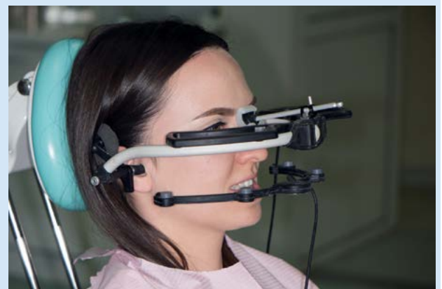
Slika 2. Ultrazvučni uređaj za snimanje kretnji donje čeljusti na temelju šest stupnjeva slobode

Figure 1 Registration of the centric relation position using a bite plate with a jig and a chin point guidance method.