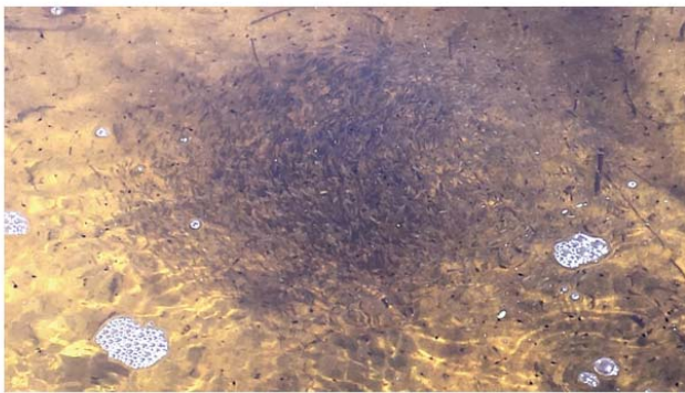
Fig 4. School of approximately 4,000 ten-mm Rio Grande silvery minnow. The school is approximately 0.18 m 2 .

Fig. 3 shows a school of about 700 adults (ca 60–75 mm) and Fig. 4 shows a school of about 4,000 ten-mm fry. When in schools, fish density is quite high. For example, density of adults in the school in Fig. 3 is about 117 fish/m 2 , and that of the fry in Fig. 4 is about 22,200/m 2 . It is possible that adult fish density could be greater, but our endangered species permit restricts us to maximum of 750 brood fish in the refugium.