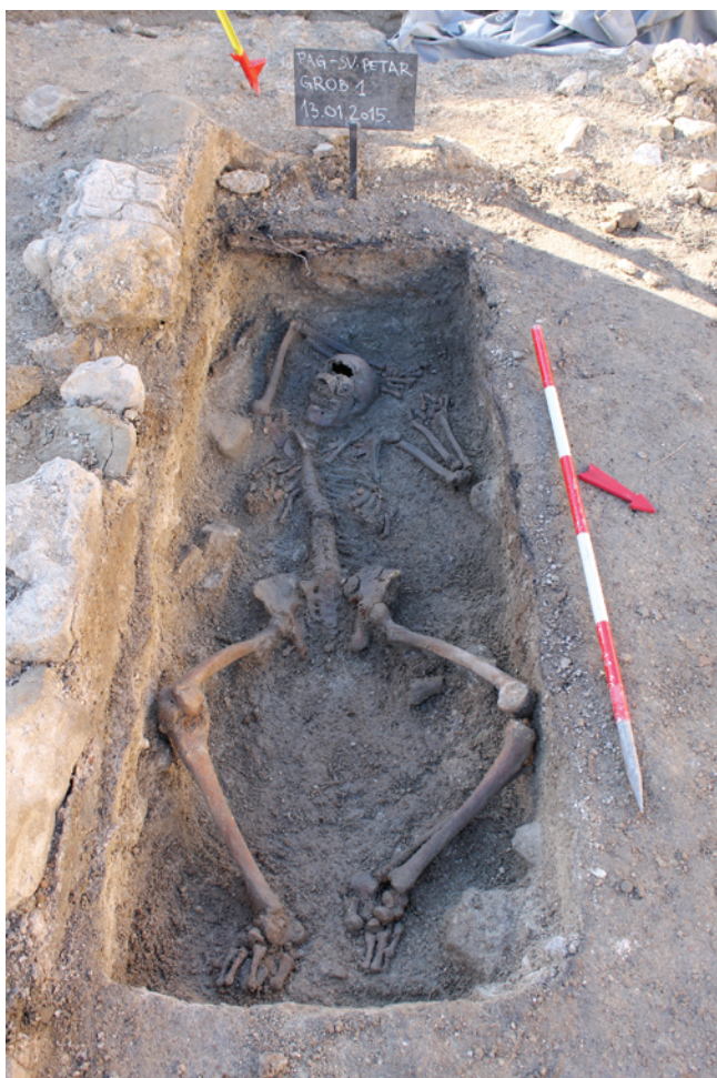
Slika 8. Grob 1