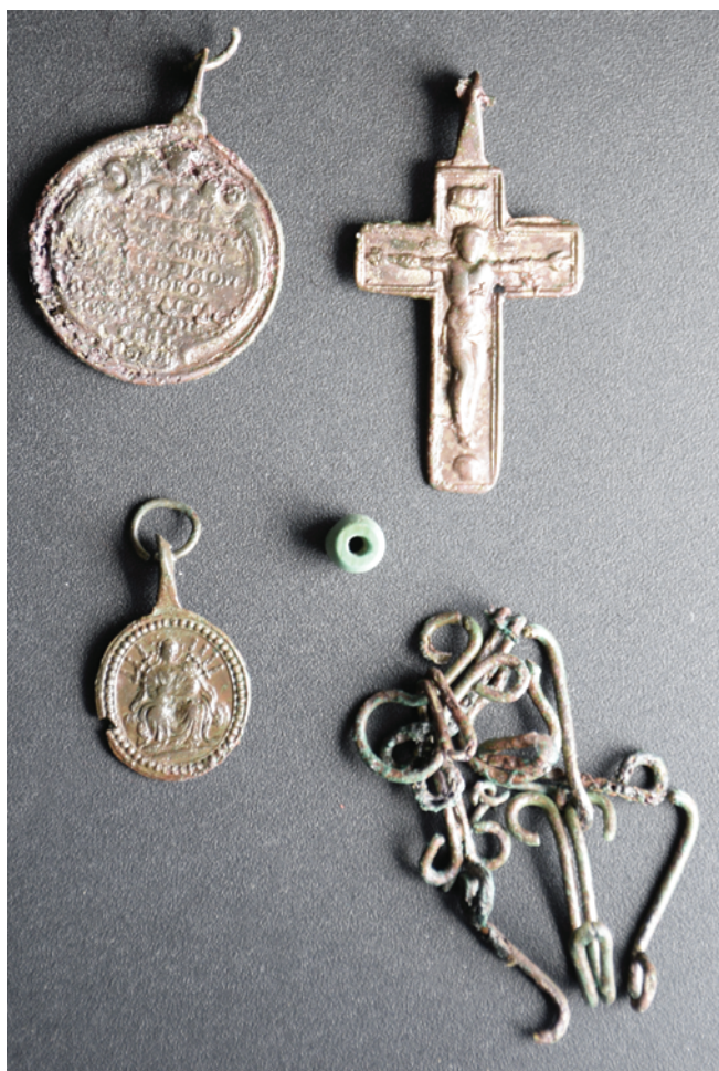
Slika 15. Medaljice i djelovi krunice iz groba 1

Figure 15. Medals and parts of rosary from Grave No. 1