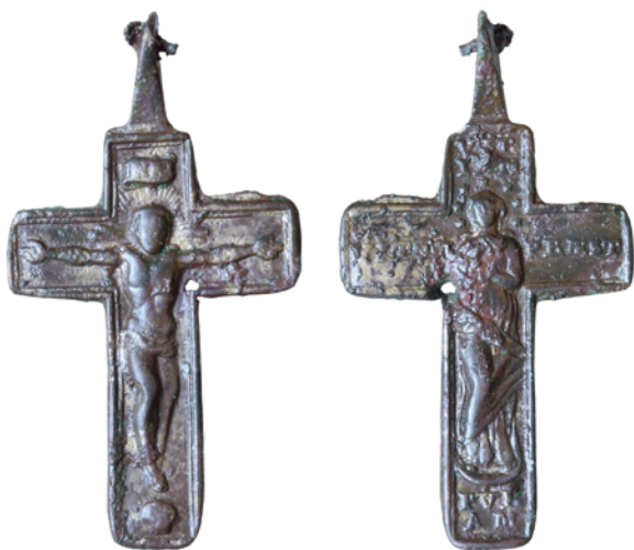
Slika 11. Latinski križić vitam praesta

Latinski brončani križić vitam praesta s okomitom ušicom, dimenzija 46 x 25 mm i težine 3,82 g, ima prikaz na licu i naličju. Na vrhu križa nalazi se ušica na kojoj su se sačuvali ostatci alkice kojom je bio pričvršćen za krunicu. Na licu se nalazi prikazan raspjeti Krist s natpisom INRI iznad glave, a na patibulumu križa ispod Kristovih nogu nalazi se Adamova lubanja. Na naličju je prikazana Bogorodica koja stoji na polumjesecu, ruku sklopljenih na prsima, a oko glave joj se nalazi svetokrug od sedam zvijezda. Iznad glave, na patibulumu križa, nalazi se natpis VIR IMM ( Virgo immaculata – Bezgrešna Djevica). Na lijevoj strani antenne teče natpis VITAM , a na desnoj PRAEST . Ispod nogu Bogorodice središnji je dio natpisa - PVRAM . Cjelokupni natpis na naličju glasi: VITAM PRESTAM PURAM („Čestit život daj nam“). 14