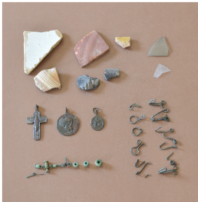
Slika 9. Nalazi iz groba 1

Grob 5 nalazi se uz bočni sjeverni zid mlade crkve. Dužina groba je 1,71 m, a širina je u najširem dijelu 0,58 m. Grob je uništio najveći dio prve sjeverne lezene na bočnome zidu starije crkve. Zid je ovom prilikom razvađen i iskorišten za dio grobne arhitekture. Lezena je