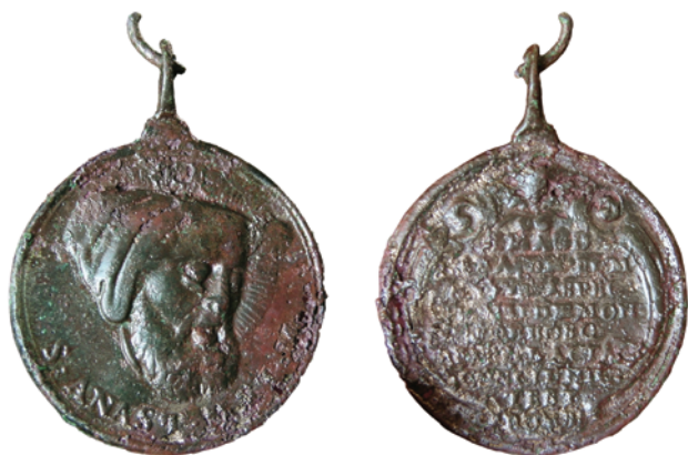
Slika 13. Medaljica iz groba 1 s prikazom sv. Anastazija

Figure 13. St. Anastasius medal from Grave No. 1