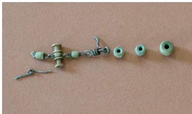
Slika 12. Zrna i dijelovi krunice

U grobu 1 pronađene su dvije svetačke medaljice koje su se nalazile zajedno, spojene jednom alkom. Prije čišćenja i konzervacije manja medaljica nije bila uočljiva, budući da su bile slijepnjene jedna za drugu. Uspješnim zahvatom, unatoč oštećenosti, medaljice su odvojene, a prikazi na njima sačuvani.