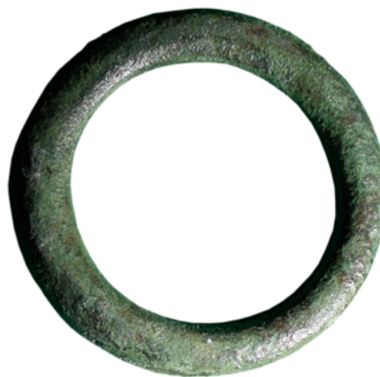
Slika 16. Brončana alka iz groba 6

S obzirom na to da su arheološka istraživanja ostataka crkve sv. Petra na Prosici provedena u zimskim mjesecima, vremenski su uvjeti otežavali radove, a u nekim trenucima ih i onemogućavali. Istraživši ostatke crkve, možemo pratiti njezine faze razvoja, odnosno stradanja građevine, što se u velikoj mjeri podudara s povijesnim izvorima. Ubiciranjem crkve sv. Petra prestaju nagađanja o njezinom smještaju na Prosici, no ostaje i dalje nedoumica gdje se nalazio samostan koji se navodi uz crkvu. Budući da je ovo područje u srednjem vijeku i kasnije promijenilo namjenu izgradnjom magazina za sol, smatramo da bi se ostatci samostana mogli nalaziti unutar njih. Osim predaje starijih mještana Paga o pronalasku ljudskih kostiju u neposrednoj blizini magazina, sama konfiguracija terena na Prosici sugerira da bi se samostan nalazio po sredini, na čvršćem dijelu poluotoka. Stoga je nužno prilikom obnove i revitalizacije magazina za sol provesti sondažna arheološka istraživanja u unutrašnjosti kako bi se locirali eventualni ostatci samostana i nekropole.