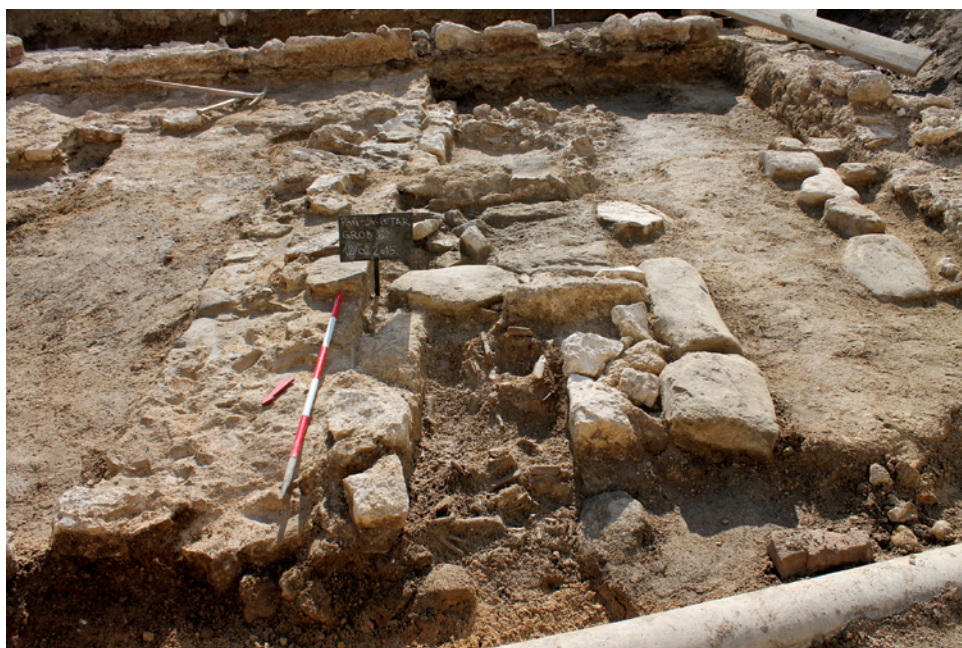
Slika 4. Ulaz u stariju crkvu s ostacima kosturnice (grob 6) Figure 4. Entrance to the older church with the remains of the ossuary (Grave No. 6)