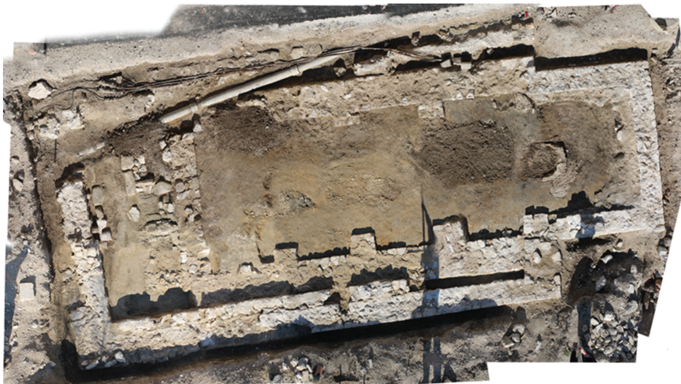
Slika 5. Fotogrametrijski snimak nalazišta