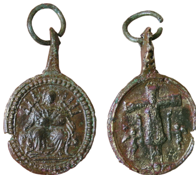
Slika 14. Medaljica s prikazom „Majke sedam žalosti“

Osim medaljica i križića koji su pronađeni u grobu 1, među metalne nalaze spada i nalaz kopčica za odjeću. Pronađeno je desetak kopčica koje su većinom bile fragmentirane zbog