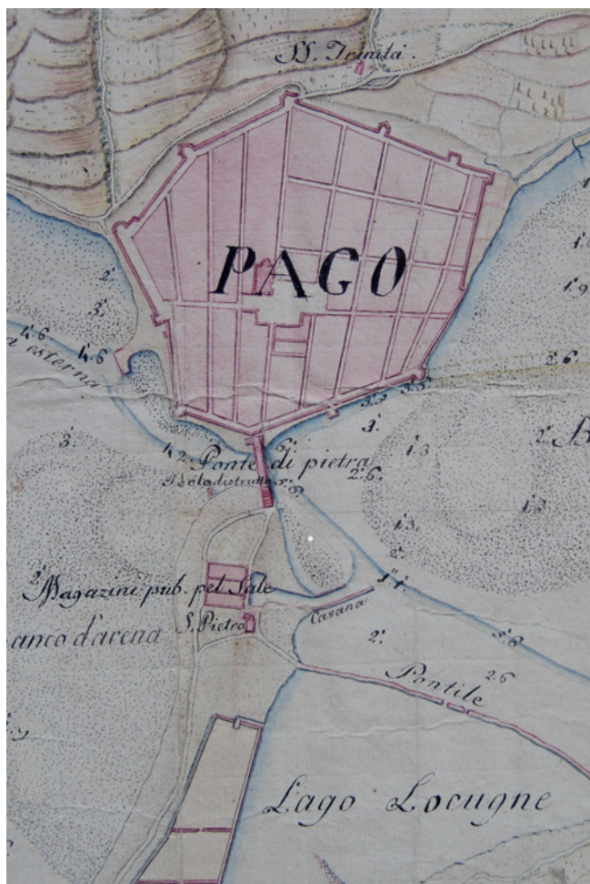
Slika 1. Prikaz Paga na mapi Grimani