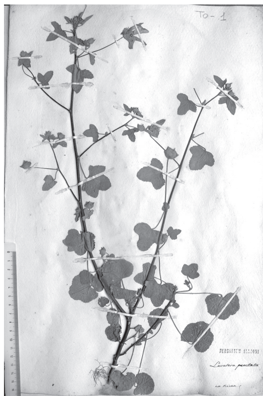
Fig. 2. Neotype of the name Lavatera punctata (TO-1!).

Lavatera trimestris L., Sp. Pl. 2: 692. 1753 ≡ Malva trimestris (L.) Salisb. var. trimestris , Prodr. Stirp. Chap. Allerton: 381. 1796 ≡ Lavatera rosea Medik., Malv.: 40. 1787, nom. nov. pro Lavatera trimestris L., nom. superfl. et illeg. (Arts. 52.1,