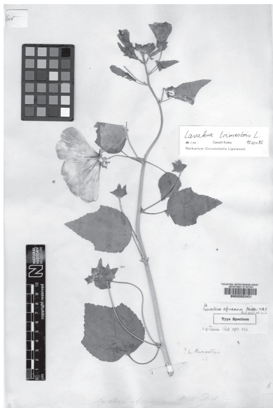
Fig. 1. Neotype of the name Lavatera africana (BM-000603431!).