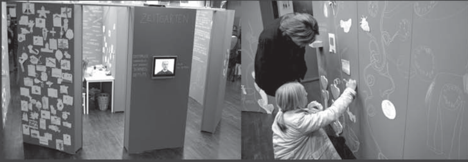
Zeitgarten, a project for the Mach-Mit-Museum, Aurich, 2010 Art mediation projects for the Städtische Galerie Nordhorn, 2010 Think Workshop, in the context of the exhibition Hannah-Arendt-Denkraum, Berlin, 2006