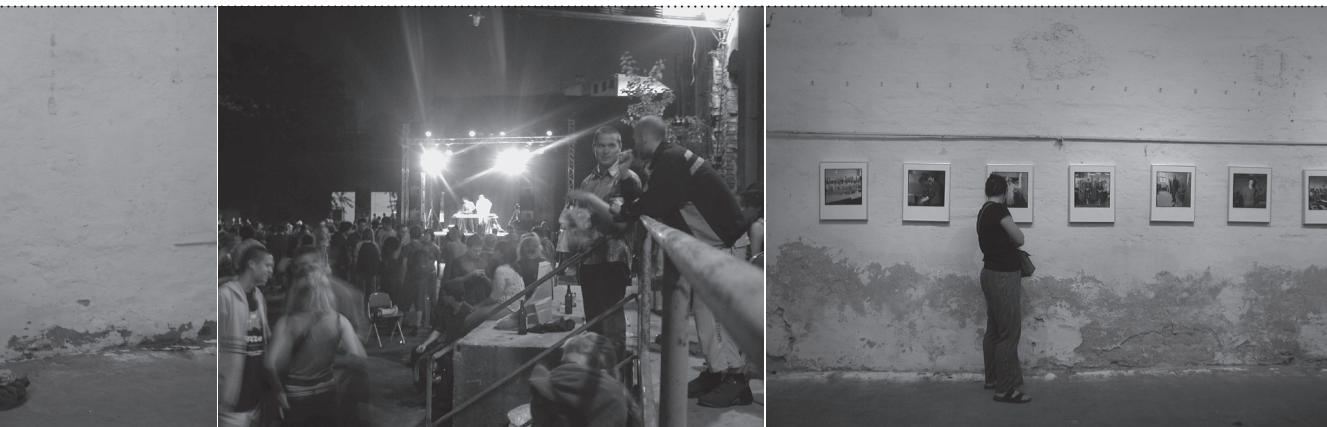
OPERACIJA GRAD: STARA TVORNICA BADEL, ZAGREB, 2005 OPERATION CITY: FORMER FACTORY BADEL, ZAGREB, 2005

Iskustva šezdesetih godina i radovi radikalnih