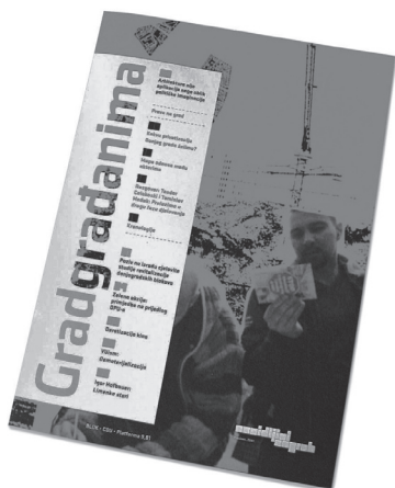
GRAD GRAĐANIMA, CENTAR ZA DRAMSKU UMJETNOST, LOKALNA BAZA ZA OSVJEŽAVANJE KULTURE, PLATFORMA 9,81, ZAGREB, 2007.

dirnuto u samo „srce grada“. Čitav taj konflikt je s obje strane vođen argumentima koji nisu bili zasnovani na stručnoj urbanističkoj debati, izostala je i jasnija elaboracija o tome što je to javni, a što privatni prostor. Ti pokazatelji indiciraju razmjerno nisku razinu opće i političke kulture, ali je pri tome napokon nadiđena ravnodušnost građana prema javnom dobru. U tom smislu mi je zanimljiva određena doza iracionalnosti i mogućeg aktiviranja nekih neuralgičnih slojeva društveno nesvjesnog koji bi u daljnjoj analizi