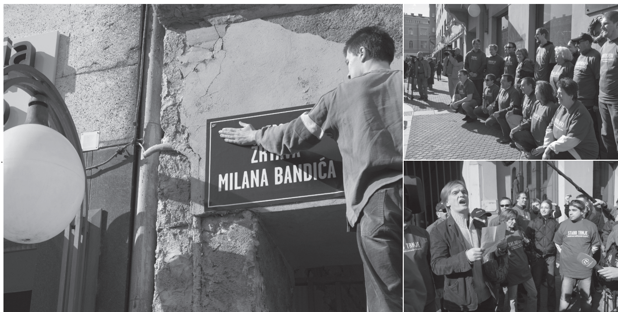
PROTESTS AGAINST PLANNED CONSTRUCTION IN CVJETNI TRG BLOCK, ZAGREB, 2008

legitimized by “sanitarization of the rat holes”. The fierce reaction from the citizens (and artist) only happened when the mere “heart of the city” was affected. The whole conflict, on the both sides, was led by the arguments that were not based on professional urban debate, even the clear elaboration on what is the public, and what the private space, was missing. Those indicators show a rather low level of general and political culture, but within that the indifference of citizens towards the public good was finally overcome. In that sense I find it interesting that certain