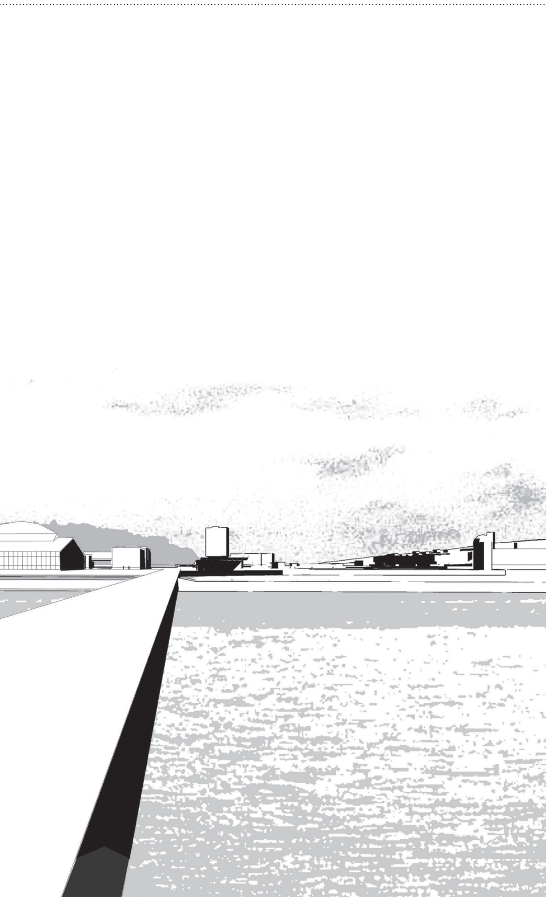
PULSKA GRUPA: MULTITUDA OSVAJA NOVU OBALU, UR- BANISTIČKI PRIJEDLOG, PULA, 2008