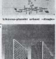
MIES VAN DER ROHE. Elementarna prostorna plastika