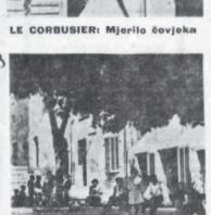
Infimna stare gradске jezgre