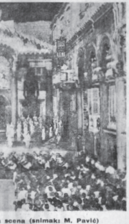
Grad - kolektivna prostorna scena