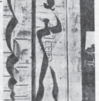
LE CORBUSIER: Mjerilo čovjeka