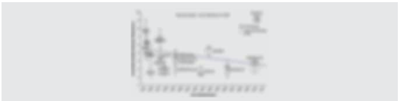
FIGURE 1. Rates of sudden death per 100 patient-years in heart failure with reduced ejection fraction trials.

The 2016 ESC guidelines recommend primary prevention ICD in both ischaemic and non-ischaemic cardiomyopathy. 1 This was called into doubt by DANISH, 28 where primary prevention ICD in non-ischaemic cardiomyopathy reduced sudden cardiac death but not all-cause death. In a secondary analysis, the association between ICD and survival decreased with age, and a cut-off of 70 years was suggested to yield the highest survival for the population as a whole. 29 Furthermore, inappropriate ICD therapy appears more likely in patients with more severe HF. 30 At the same time, in the last year, several meta-analyses point to a distinct reduction in both sudden and all-cause death. 31-34 Patients in these meta-analyses may have had less effective medical therapy than contemporary patients. Indeed, a large analysis from 12 clinical trials suggested that the rates of sudden death have declined over time ( Figure 1 ), 35 which would be consistent with potentially lower benefit of primary prevention ICD in patients with contemporary treatment. Furthermore, benefits may differ substantially depending on e.g. age 28 and concomitant use of CRT, and in several recent studies multivariable prediction models