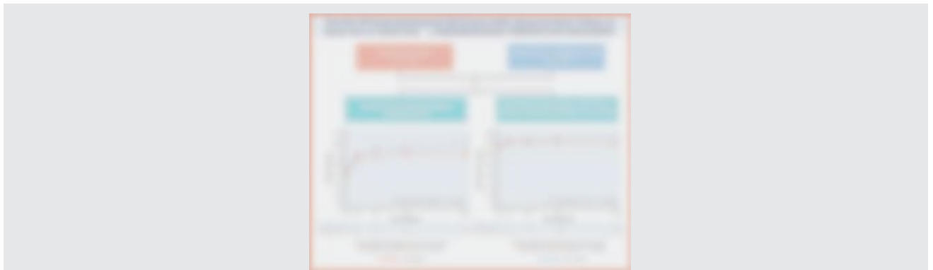
FIGURE 3. In PAL-HF trial, palliative was significantly superior to usual care in improving quality of life.

As much as we need to focus on optimal utilization of existing therapy, HF remains a chronic, incurable, generally irreversible, and still debilitating syndrome, and novel inventive approaches have continued appeal. A new myosin activator which improves impaired contractility, omecamtiv mecarbil, was studied in the phase II study COSMIC-HF. 82 Titration guided by pharmacokinetics resulted in improved cardiac function and decreased NT-proBNP. 82 A Phase III trial is ongoing. Stem cell therapy has generally proven disappointing, but in the exploratory REGENERATE-IHD and CHART-1, intramyocardial injection of autologous bone-marrow derived cells in ischaemic cardiomyopathy appeared safe and improved EF, New York Heart Association (NYHA) class and NT-proBNP, and left ventricular (LV) end-systolic and diastolic volumes. 83-85 Novel radiocarbon ( 14 C) techniques allow assessment of cardiomyocyte turnover dynamics and may provide a future foundation for regenerative strategies. 86 The ESC Task Force for stem cells in myocardial infarction and HF 87 and a global position statement on cardiovascular regenerative medicine 88 outline challenges for the stem cell field, and standardization of animal models, clinical trials and regulatory procedures are put forth as necessary for future success.