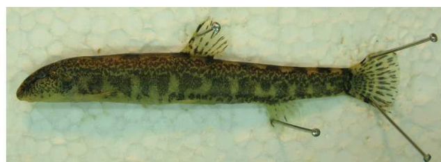
Fig 4. Body pigmentation – type III (river Oskova)