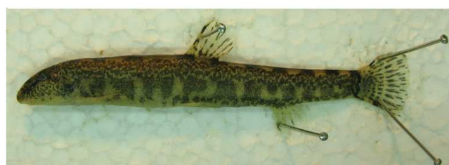
Fig 3. Body pigmentation – type II (river Gostelja)