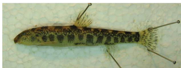
Fig 2. Body pigmentation-type I (river Gostelja)

The analysis determined that there are certain differences between the analyzed individuals in terms of their body pigmentation. However, those pigmentations are not so distinct that one population could be singled out. Different types of pigmentation were present within the individuals of all the analyzed populations. Their body is mostly marble-colored, and there are 8-12 dark blotches along the sideline which are not necessarily complete, and this particularly refers to the tail region. The back of the analyzed individuals is also mottled, with clear dark blotches whose number varies from 8 to 11. The dorsal fin, caudal fin and anal fin can have series of dark spots. At the base of caudal fin, there are two dark spots which are extended toward its central part, and they have the tendency to merge, which was confirmed in some individuals. Different types of body pigmentation are shown in figures 2, 3, 4 and 5.