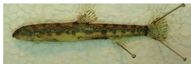
Fig 5. Body pigmentation – type IV (river Trebačka)