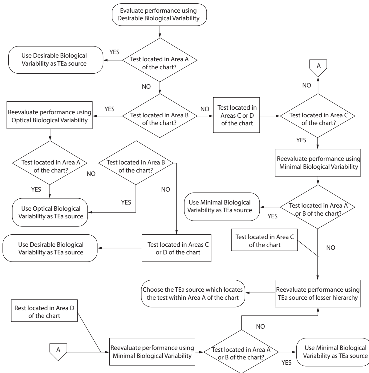
FIGURE 2. Selection algorithm for TEa source. The algorithm presented was designed on the basis of the areas defined in Figure 1.

the same time frame and the Sigma metrics was calculated monthly.