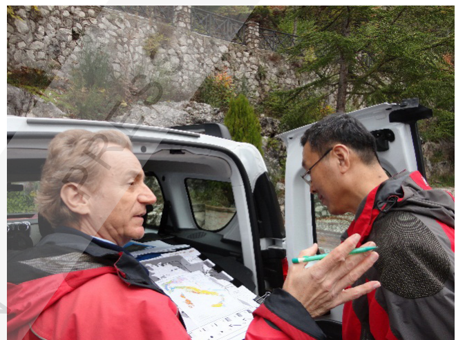
Figure 2. Hydrogeological Survey in Italy. The Rieti Plain landscape (left) and some calcareous rocks cropping out at the Rieti Plain margin (right) can be seen in the background.

standardization. Among these, it constitutes a cornerstone and starting point for cooperative research to compare common and diverse features of Chinese and Italian hydrogeological mapping guidelines.