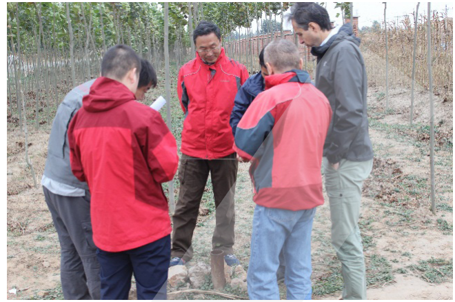
Figure 1. Hydrogeological Survey in China. The Luan River near its mouth (left) and alluvial sediments of the Luan River Plain (right) can be seen in the background.