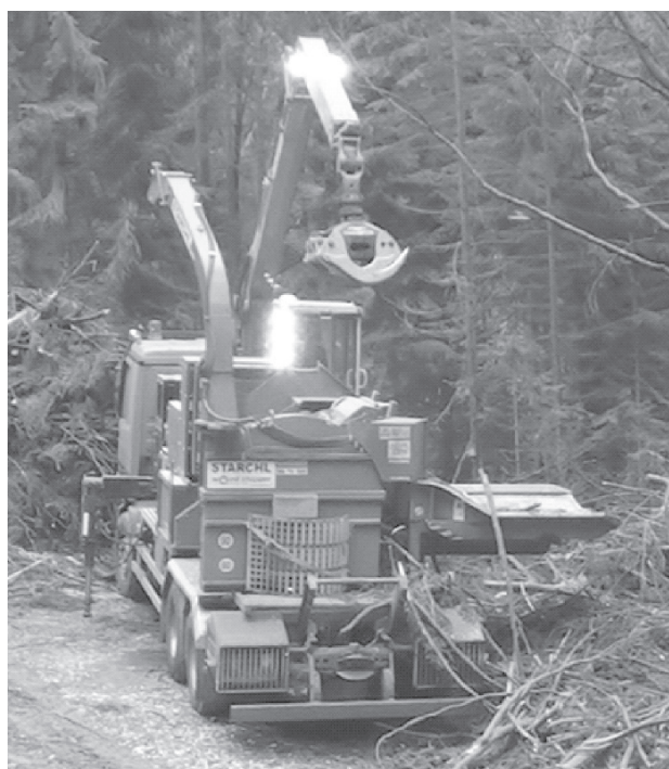
Fig. 1 The Starchl MK74 600 mounted on a truck chassis

The truck chassis was supported by 3 axles. The power was transmitted to rear two axles of the chassis, with locking differentials. The machine was quite heavy and axle weight was close to the maximum Slovenian