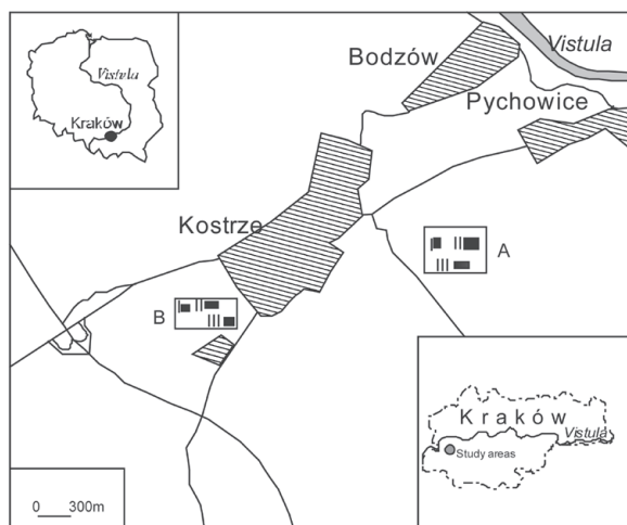
Figure 1. The localities Patches with considerable share low- and medium-growing perennials (I), tall-growing perennials (II), as well as tall-growing perennials and shrubs (III) in study areas A and B.

The investigations were carried out in the south-western part of Krakow (southern Poland) in the Kostrze district (N 50°1'26"; E 19°50'1") at ca. 210 m a.s.l., on the low flood terrace of the Vistula River where the limestone hills (Jurassic–Cretaceous) and tectonic depressions of the Brama Krakowska gate occur. The greatest area is covered by abandoned meadows from alliance Molinion caeruleae Koch 1926. In its vicinity numerous plant communities have formed, from the deciduous forests covering the slopes of the Vistula valley, through the xerothermic calcareous grasslands occurring on limestone and chalk hill slopes, to the ruderal communities appearing near buildings and along the edges of roads (30).