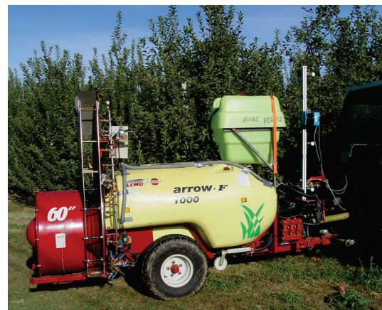
Figure 3 Ultrasonic and LIDAR sensors equipped air assistance sprayer [40]

Ježić, V. et al. [31] develop an automatic spraying system, where computer-controlled spraying is achieved by the use of ultrasonic sensors and an RGB camera. The automatic system is tested at a speed of 3 kmh -1 where, with respect to the control sensor-free spraying, the savings of 20.2% per each nozzle are achieved. The same authors state that the deposit, distribution and surface coverage remained unaltered by the use of sensory spraying.