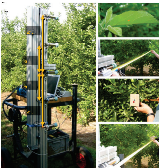
Figure 4 Test platform with ultrasonic sensors [42]

The usage of ultrasonic sensors in agricultural production has been tested on several factors. One of the key factors is the distance of the sensor from the treetop and the speed of the sprayer's movement. If the distance of the sensor is smaller, the echo ultrasound wave (echo signal) will be of greater intensity, and thus the accuracy of the measurement, while by increasing the distance, the echo signal is weakened and errors occur when reading the results [14]. If the treetop is at a small distance between the treetop and the sensor, the possibility of interference between the two sensors increases and the reading accuracy decreases [43]. According to the above mentioned authors, the average reading error in laboratory conditions is \pm 0.53 cm, while in field conditions, the detection error is \pm 5.11 cm, taken on the average. By analyzing the obtained results, it can be concluded that it is very important to determine the correct distance between the ultrasonic sensors with respect to the width of the angular ultrasound waves and the distance from the detected treetop. In Fig. 4, a test platform with differently positioned ultrasonic sensors for determining a reasonable distance between sensors and treetops, with the aim of preventing the interference, is shown.