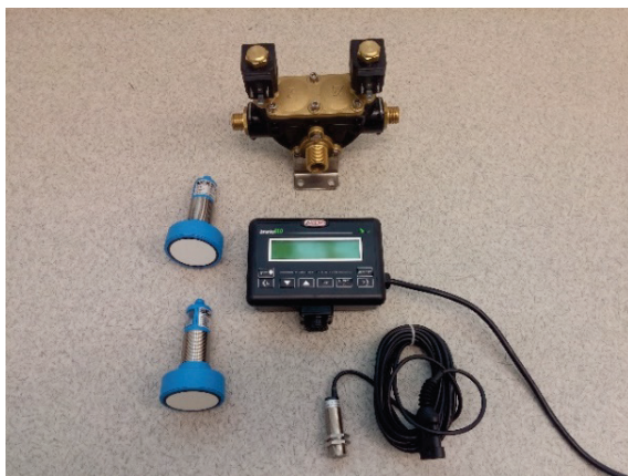
Figure 2 Ultrasonic Sensor System

The most common type of ultrasonic sensor construction is in the form of a prism or a cylinder. The transceiver head may be separated from the electronic part, enabling it to be installed at inaccessible locations. The use of ultrasonic sensors in agriculture is as an idea taken from the industry, where they are used to measure different distances and determine the presence of objects [21]. Fig. 2 shows the complete system of ultrasonic sensors with electromagnetic valves and the control unit used on the sprayers.