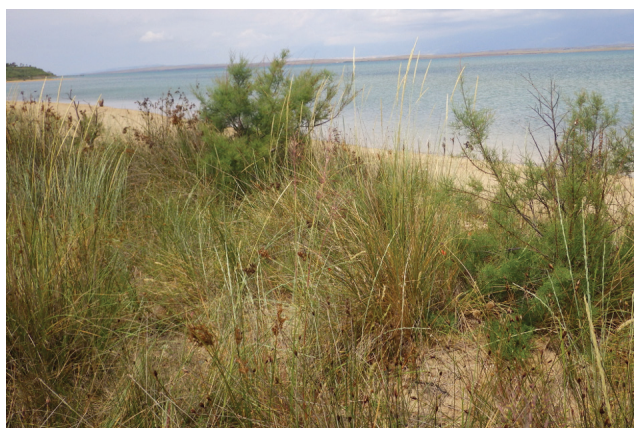
Fig. 3. Habitat of Ammophila arenaria (L.) Link subsp. arundinacea H. Lindb. in Kraljičina plaža near the town of Nin.

Croatia are very rare and psammophytic vegetation of the order Ammophiletalia is extremely endangered (Alegro et al. 2004). Due to the very small and localized areas of these habitats, as well as by the quoted psammophytic species they are also colonized by many species of neighbouring ruderalized habitats as can be seen from those three phytosociological relevés (Tab. 1). Therefore, the researched community can be considered an impoverished wet variant of the association Euphorbio paraliae-Agropyretum junceiformis Tüxen in Br.-Bl. et Tüxen 1952 corr. Darimont, Duvigneaud et Lambinon 1962 ( Ammophilion Br.-Bl. 1921, Ammophiletalia Br.-Bl. et Tüxen ex Westhoff et al. 1946) as defined by Šilc et al. (2016).