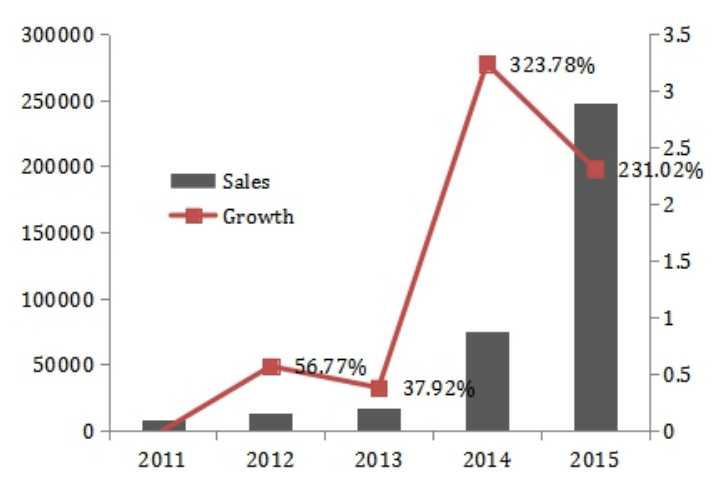
Figure. 2. Sales and Growth of the Chinese EV industry.

According to Lu, Liu, Tao, Rong and Hsieh [5], government, car manufacturers, EV infrastructure and consumers all play critical roles in industrial evolution. Shang and Shi [6] provided a comprehensive analysis of the structure of the EVs business ecosystems. Lu, Rong, You and Shi [8] used an agent-based system to investigate stakeholders' interactions in the ecosystem. They both found that the focal firms need to organize the ecosystem cooperation. Further, Rong, Shi, Shang, Chen and Hao [3] developed the structure and operating mechanisms of business ecosystems. Yang, et al. [26] also considered the support mechanisms among the government, social capital and intermediaries along the EV value chain for constructing charging infrastructures.