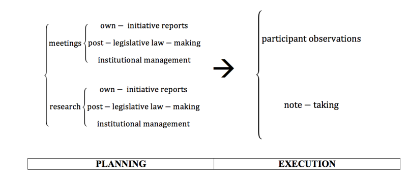
Figure 2. Graphic summary of the planning and execution stages.

In terms of activities, there were two key variables to define the fieldwork methodologies: (i) meetings and (ii) work-related research. Each one of these activities comprised three topics, which were own-initiative reports, post-legislative law-making and institutional management.