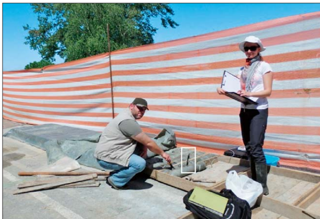
Figure 2: Detailed borehole core determination and in situ measurement of thermal properties in Čakovec. Needle probe inserted into the core is emphasized by a white rectangle.

stalled into three 100 m deep exploratory boreholes and one 130 m deep borehole, Zagreb-AL. The outer diameter of the boreholes is 152 mm and after installation of borehole heat exchanger, the boreholes were grouted by a thermally enhanced grout. Thermal response tests were performed at all four locations.