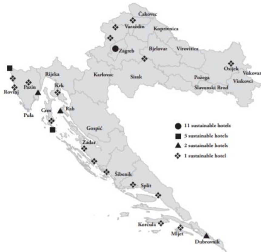
Figure 1: Map of certified eco-friendly hotels by destination in Croatia