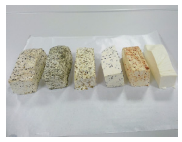
FIGURE 1. Cheeses with added spices: black cumin, mint, thyme, isot pepper, red pepper and plain

Raw milk was pasteurized at 85 °C for 15 seconds and cooled to 32 °C. Starter culture was added at the level of 1 % and held for 60 min. Then milk was coagulated with rennet for 75 min. After coagulation, curd was cut into 8-10 mm cubes with a wire knife and pressed for 120 min. Whole curd was divided into six portions one being the control group (CC) without any spice. Selected spices were added (3 % (w/v), based on milk volume) to the rest of the five groups as follows; black cumin (B1), mint (B2), thyme (B3), red pepper (B4) and isot pepper (B5). Curd was weighted and spices were thoroughly mixed into the curds. Curd was pressed overnight and then cut into blocks with dimensions of 6×6×5 cm (Figure 1). The curds were salted with dry salt (the amount of dry salt used was 3 % of cheese weight) and held 24 h within salt. The cheese samples were vacuum-packed and ripened at 4±1 °C for 90 days. Two batches of cheese samples were prepared for each cheese type.