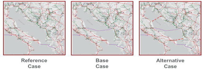
Figure 1: Illustration of analyzed scenarios

Reference Case scenario was created for comparison of the Base and Alternative Case scenario results. Reference Case scenario includes only the existing HVDC cable Greece-Italy and thus it presents current status of the regional interconnections to Italy. Base and Alternative Case scenario results are compared in terms of yearly electricity generation, average wholesale prices, net interchange, total transfer and cross-border loadings.