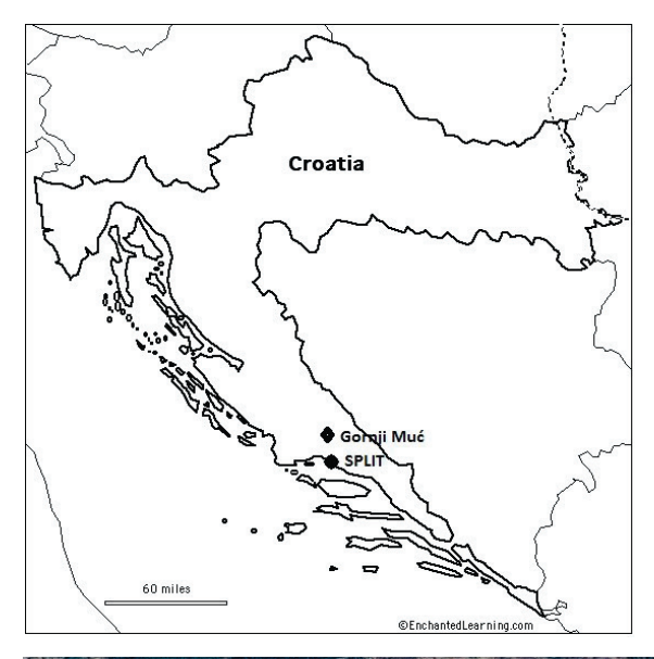
Fig. 1. Position of the village Gornji Muć and the city of Split in Croatia.