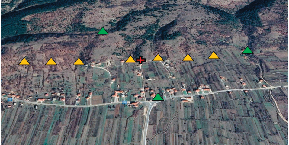
Fig. 2. Locality of Grudina (red cross) in Gornji Muć with periodic brooks (yellow triangles) and permanent creeks (green triangles) in vicinity.

Etymology: The name of the species is adjectival toponym after country of its origin (Croatia).