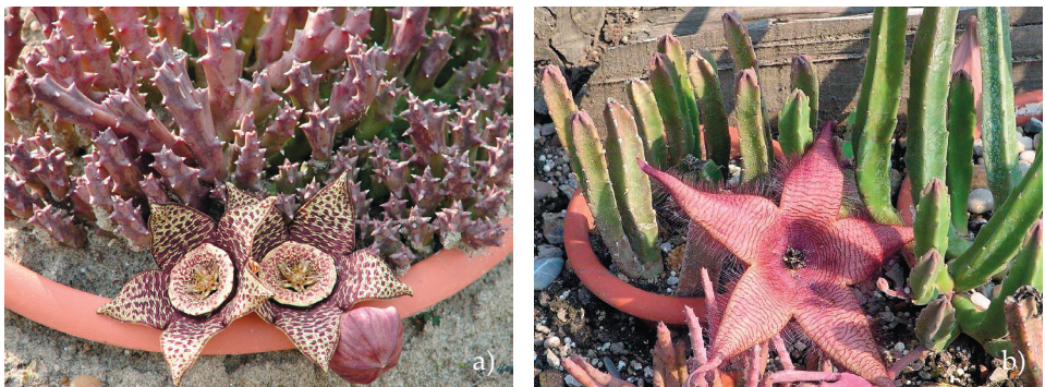
Fig. 9. Representatives of Asclepiadaceae family: a) Orbea variegata (L.) Haw., b) Stapelia grandiflora Masson.

Sl. 8/8-1. Euphorbia virosa Willd. nalazi se na CITES-popisu