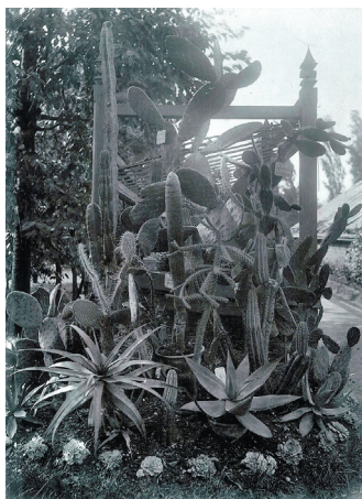
Fig. 2c. Garden bed with ornamental eaves, holding a part of the cold glasshouse succulent collection, displayed during summertime by the Exhibition Glasshouse (probably between 1920 and 1930).

Sl. 2a. Veliki kotač, krug ili kolo: dio zbirke stakleničkih mesnatica ljeti izložen ispred Vrtlarske kuće (danas uprava Vrta; vjerojatno krajem 1890-ih).