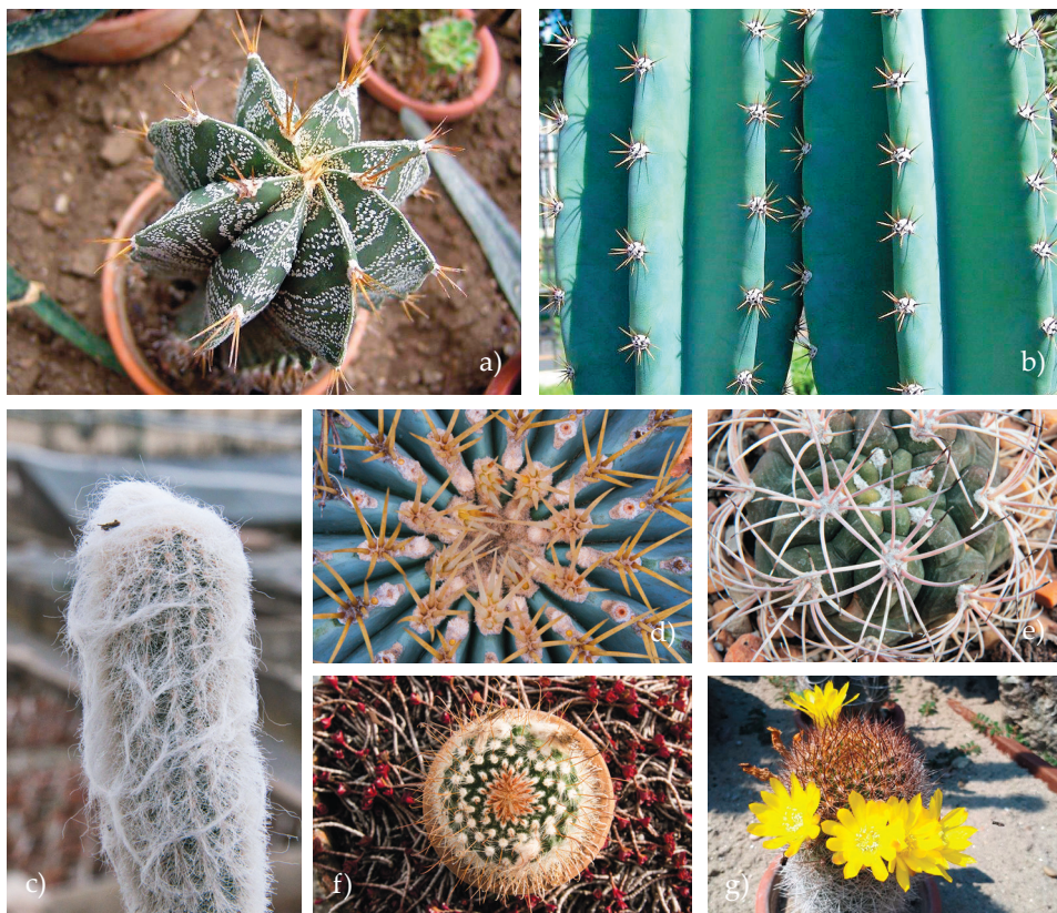
Fig. 6. Representatives of Cactaceae family: a) Astrophytum ornatum (DC.) Britton & Rose, b) Cereus repandus (L.) Mill., c) Espostoa lanata (Kunth) Britton & Rose, d) Ferocactus glaucescens (DC.) Britton & Rose, e) Gymnocalycium saglionis (Cels) Britton & Rose subsp. tilcarensis (Backeb.) H.Till & W.Till, f) Parodia mutabilis Backeb, g) Weingartia neocumingii Backeb." – all listed in CITES.

Sl. 5. Predstavnici porodice tustika (Crassulaceae): a) Crassula muscosa L. var. muscosa , b) predstavnici roda Aeonium (mnoge vrste također i na popisima invazivnih vrsta poput EASIN-a)