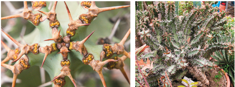
Fig. 8/8-1. Euphorbia virosa Willd. is listed in CITES

Sl. 7. Predstavnici porodice čupavica (Aizoaceae): a) Pleiospilos compactus Schwantes subsp. canus H.E.K. Hartmann & Liede, b) Lithops lesliei (N.E. Br.) N.E.Br. subsp. lesliei (seedlings – new species in collection), c) Glotiphyllum longum (Haw.) N.E.Br. (klijanci – nova vrsta u zbirci).