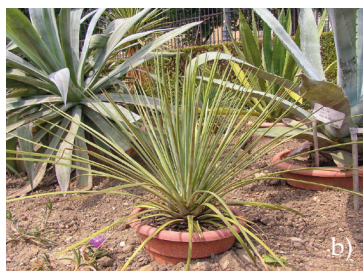
Fig. 13. Representatives of the Agavaceae family: a) Agave victoriae-reginae T. Moore, listed in CITES, b) Agave striata Zucc.

Sl. 13. Predstavnice porodice agava (Agavaceae), a) Agave victoriae-reginae T. Moore, nalazi se na CITES-popisu, b) Agave striata Zucc.