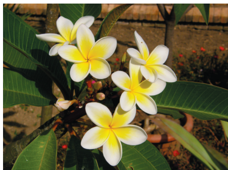
Fig. 10. Representative of the Apocynaceae family: Plumeria obtusa L. cult.

Sl. 10. Predstavnik porodice zimzelena (Apocynaceae): Plumeria obtusa L. cult.