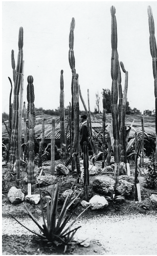
Fig. 2d. Part of the cold glasshouse succulent collection, displayed during summertime in front of the Gardener's House (nowadays Garden management; probably 1930-ies).

Sl. 2d. Zbirka stakleničkih mesnatica ljeti izložena ispred Vrtlarske kuće (danas uprava Vrta; 1930-ih).