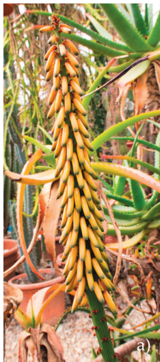
Fig. 4ab. The popular ornamental plant, bitter aloe ( Aloe ferox Mill.), has lived in the Garden cold glasshouse collection since its foundation; it is placed in both CITES and EASIN lists.

Sl. 2d. Zbirka stakleničkih mesnatica ljeti izložena ispred Vrtlarske kuće (danas uprava Vrta; 1930-ih).