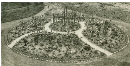
Fig. 2a. „The Big Wheel“: part of the cold glasshouse succulent collection, displayed during summertime in front of the Gardener’s House (nowadays Garden management; probably late 1890s).

Sl. 2b. Dio zbirke stakleničkih mesnatica ljeti izložen uz izložbeni staklenik (oko 1910.).