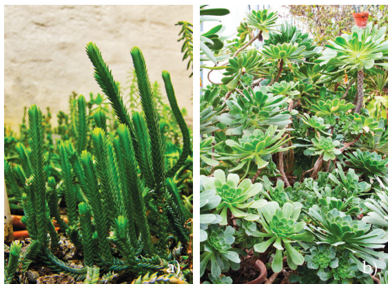
Fig. 5. Representatives of Crassulaceae family: a) Crassula muscosa L. var. muscosa , b) representatives of genus Aeonium (with many species listed in EASIN and other invasive-plants databases)

Sl. 5. Predstavnici porodice tustika (Crassulaceae): a) Crassula muscosa L. var. muscosa , b) predstavnici roda Aeonium (mnoge vrste također i na popisima invazivnih vrsta poput EASIN-a)