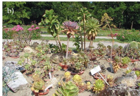
Fig. 3. Due to the lack of permanent display premises, large portions of the cold glasshouse succulent collection are still placed in the open during summertime: a) Large plants with pots are placed along the northern part of the wrought-iron fence (Marko Marulić Square)... b) ...while the smaller individuals are placed by the flower parterre in the middle part of the Garden.

Sl. 3. Zbog nedostatka prostora za trajni smještaj biljaka, dostupnog posjetiteljima, zbirka stakleničkih mesnatica i danas se ljeti iznosi na otvoreno: a) Velike biljke u posudama ukapaju se uz sjevernu ogradu Vrta, duž Marulićevog trga... b) ...dok se manje biljke smještaju uz cvjetni parter u središnjem dijelu Vrta.