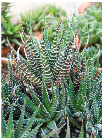
Fig. 12. Representatives of the Aloaceae family: a) all 18 species of the genus Aloe , held today in our cold glasshouse collection, are listed in CITES, b) Haworthia fasciata (Willd.) Haw.

Sl. 12. Predstavnici porodice aloja (Aloaceae): a) svih 18 vrsta tipičnog roda ( Aloe ), koje danas imamo u zbirci, nalaze se na CITES-popisu, b) Haworthia fasciata (Willd.) Haw.