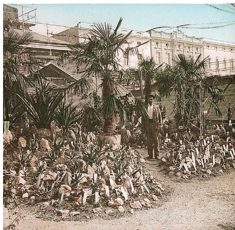
Fig. 2b. Part of the cold glasshouse succulent collection, displayed during summertime by the Exhibition Glasshouse (around 1910).

Sl. 1. Djelić današnjeg „visećeg“ dijela zbirke stakleničkih mesnatica: Senecio rowleyanus H. Jacobsen, Caralluma europaea (Guss.) N.E.Br., C. joannis Maire, Orbea variegata (L.) Haw.