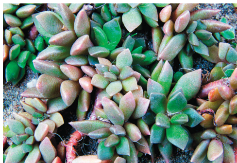
Fig. 11. Representative of the Portulacaceae family: Anacampseros rufescens (Haw.) Sweet, listed in CITES.

Sl. 10. Predstavnik porodice zimzelena (Apocynaceae): Plumeria obtusa L. cult.