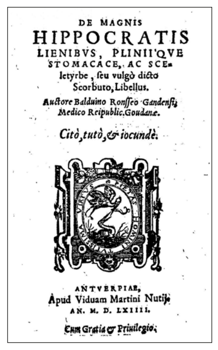
Fig. 4. Title page of Ronsse's compilation on scurvy

to your uncle and now I send you the same again. There are also quotations in them from the two letters on scurvy of Blyenburg, which I certainly could not omit, and also from the letter of Echtius which were subsequently (as I have said) included in the Epitome and were also printed at the end of Ronsse's book." <sup>64</sup>