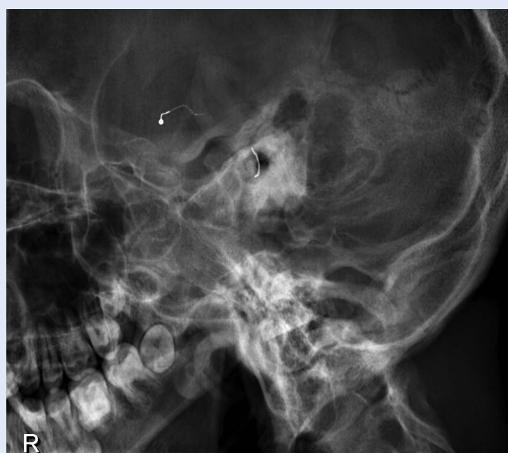
Figure 3. Schüller X-ray reveals cochlear electrode completely expelled outside the cochlea.

During surgery, it was found that the electrode was completely out of the cochlea and the cochleostomy site was clogged with fibrous tissue. The ear was dry and there was no sign of inflammation.