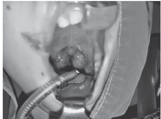
FIGURE 3. Palatine tonsils and adenoids sent for histopathologic analysis.

On initial assessment, the child was found to weigh 10 kg (5 th percentile) and was 85 cm in height (a little over 50 th percentile) (5). He had large, hypertrophic, 'kissing' tonsils (grade IV) with modified Mallampati score III. Anterior rhinoscopy revealed clear nasal secretions, normal mucosa and no clinically significant septal deviation. Examination of the epipharynx using flexible nasendoscopy confirmed