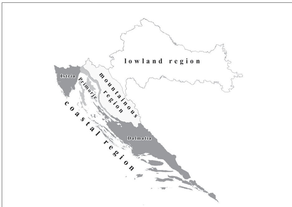
Figure 1. Regions in Croatia (lowland and mountainous regions are shown in white, coastal region with its subregions is shown in shades of grey).

Slika 1. Regije u Hrvatskoj (nizinska i planinska regija prikazane su bijelo, a primorska regija s podregijama nijansama sive).