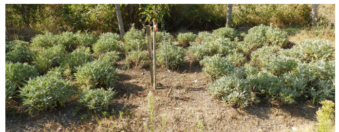
Figure 4. General view of S. officinalis experimental plants (conventionally derived plants on the left half, hydroponically derived plants on the right half).