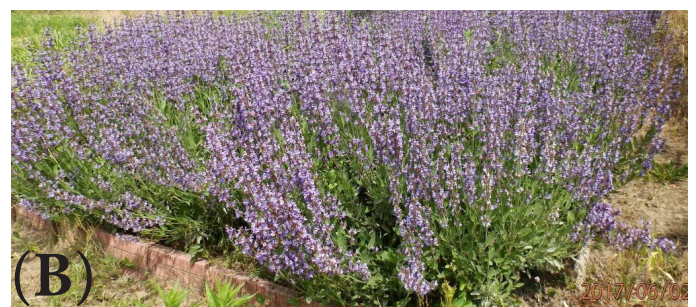
Figure 5. Conventionally (A) and hydroponically (B) derived plants during the full flowering stage in their second year on the experimental field.