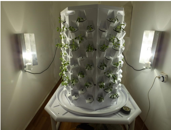
Figure 1. Vertical aero-hydroponic system Green Diamond (GH) with 5-week old seedlings of S. officinalis

Seedlings' growth was rapid and at the age of three months the average plant height was 23.9 \pm 2.5 cm and about \frac{1}{4} of all 80 plants had formed branches of second rank (Table 1).