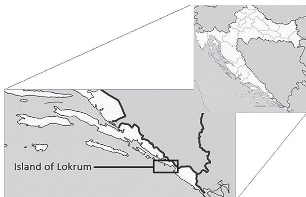
Figure 1 Geographical position of the island of Lokrum Slika 1. Geografski položaj otoka Lokruma

objectives. This paper will therefore be used as background information for setting up the conservation objectives and defining conservation measures for effective management of Lokrum Natura 2000 site.