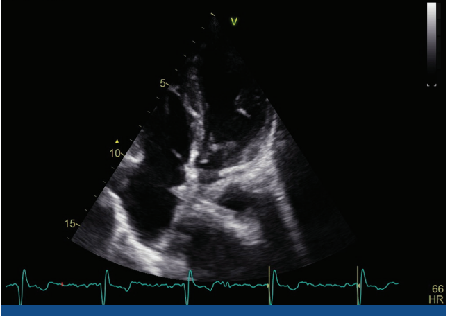
FIGURE 1. Apical four chamber view of extra cardiac mass compressing left atrium.

ORCID: Petra Angebrandt, https://orcid.org/0000-0001-5431-9736 • Dejan Došen, https://orcid.org/0000-0002-2641-4768 Maja Hrabak, https://orcid.org/0000-0002-0390-8466 • Eduard Margetić, https://orcid.org/0000-0001-9224-363X Irena Ivanac Vranešić, https://orcid.org/0000-0002-6910-9720