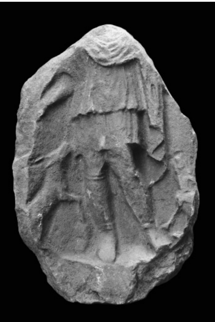
Slika 2. Ulomak reljefa s prikazom Dijane iz Trišćenice (Dragavode?) u splitskome polju (Arheološki muzej u Splitu)