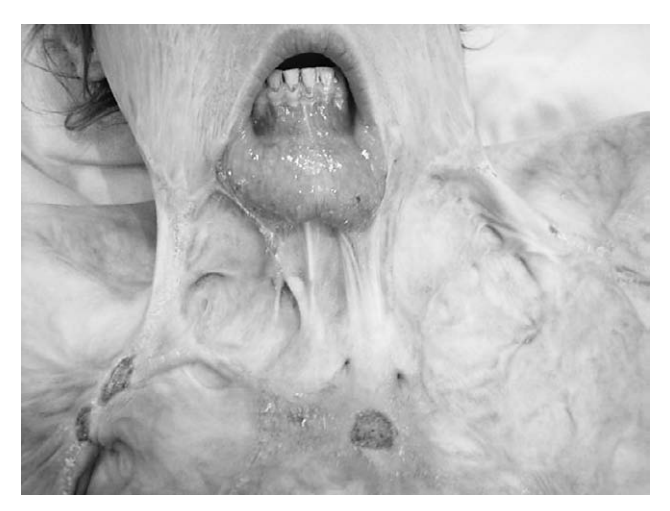
FIGURE 1. En face: Lip retraction, restricted mouth opening, hypertrophic scar extending over the neck