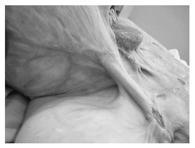
FIGURE 2. Right profile: hypertrophic scar, chin fusing with sternum, lip retraction

ryngoscopy, intubating stylets or tube-changers, supraglottic airway devices (laryngeal mask, laryngeal tube, I-gel, intubating laryngeal mask airway), laryngoscope blades of different design and various sizes, flexible fiberoptic bronchoscopes (FFBs), and light wands (4). FFBs are important means for performing awake tracheal intubation in patients with anticipated difficult airway with a success rate of 88%-100% according to the American Society of Anesthesiologists Task Force on Management of the Difficult Airway (4).