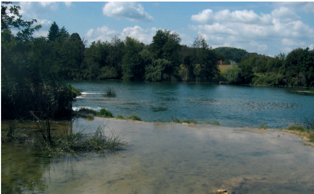
Fig. 3. The Mrežnica River in Mrežnički Brig (site No. 4).