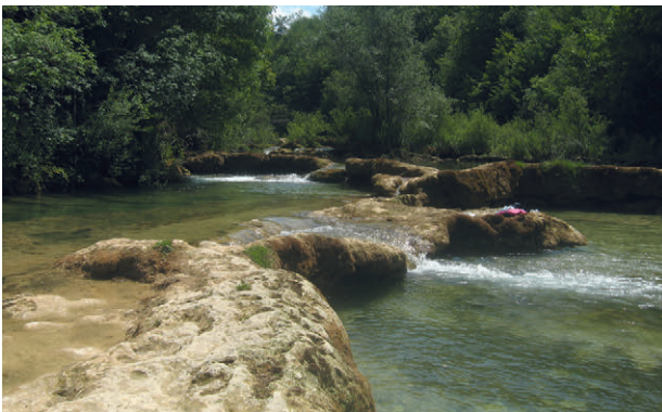
Fig. 4. The Mrežnica River near Primišlje (site No. 9).