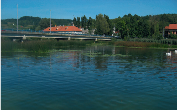
Fig. 2. The Mrežnica River in Duga Resa (site No. 3).

2 – 45°27'50.4"N, 15°32'27.8"E, Logorište, the Mrežnica River ca 2.5 km upstream of its confluence with the Korana River, 5.7.2014;