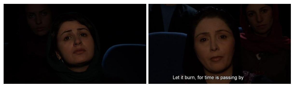
Figure 1. Shirin (Kiarostami, 2008).

Let us take for example films that do not belong to documentary film or film-essays. Even fiction film Shirin (2008) directed by famous Iranian director Abbas Kiarostami uses the transparency of the narrator to negate the supposed ideological effects by the "manipulative nature" of film. In the aesthetic sense, the film is almost a direct visual representation of Baudry's clash between the spectator and film screen, mediated by the camera/apparatus. Without any diegetic information, the film starts with shots of faces in a movie theatre en face , looking at film we as spectators are unable to see. During the whole course of film, we as spectators of the first level (extradiegetic) are prohibited from seeing what the characters (diegetic spectators) in the film see (movie on a screen). At work is a prohibition of representation and identification: extradiegetic spectators are unable to see the film's story with which the diegetic spectators are identifying, thus being unable to complete the identification process with the characters in the film.