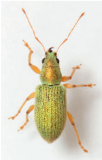
Fig. 1. Polydrusus (Conocetus) crinipes , female, Croatia: Baćinska jezera (scale 1 mm; photo: T. Nemes).

A single female specimen (Fig. 1) just freshly emerged, as the mandibular scar is still visible on the left mandible (this prolongation easily breaks off just hours after hatching) was found by hand and photographed by the co-author at Baćinska jezera in the South of Croatia, coordinates 43°4'33"N, 17°25'18"E on June 3 in 2017. The specimen was not collected, but a photo was taken for