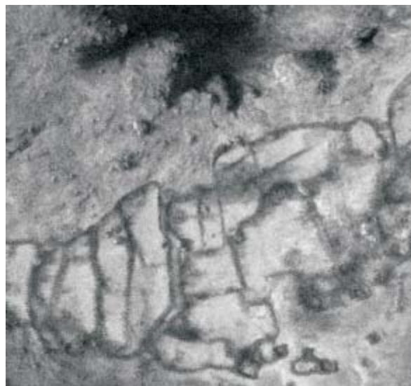
Fig. 2. (left) Original image TIR500 of the Tulove grede area (Veletbit), (right) the result of the image fusion (second principal component of the B-G-R-IR-TIR combination) based on principal component method (PCA)

Sl. 2. (lijevo) Izvorna snimka TIR500 područja Tulove grede (Veletbit), (desno) rezultat fuzije slika (druga glavna komponenta kombinacije B-G-R-IR-TIR) nastao metodom glavnih komponenti (PCA)