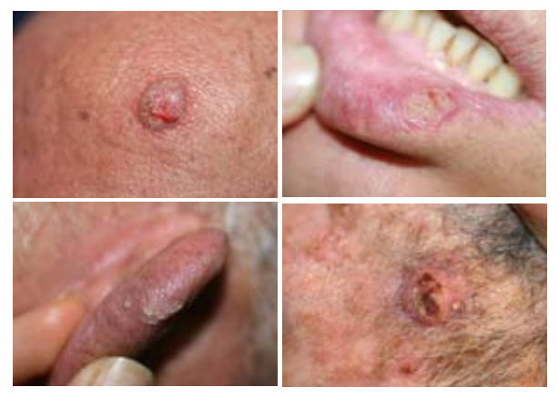
Figure 3. Clinical images of patients with squamous cell carcinoma (SCC) at various different localizations (a-d).

suggested that the adnexal involvement of atypical keratinocytes is more common for AK I lesions, which is implicated for development of invasive malignant lesions in PAKs (12).