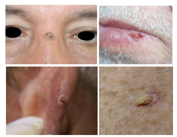
Figure 2. Clinical images of patients with proliferative actinic keratosis (PAK) at various different localizations (a-d).

In our clinic, we observed that some of our patients who were diagnosed with PAK with the punch biopsy method and who subsequently underwent excision for clinical high suspicion of an invasive tumor were found to have SCC by histopathological examination of excision materials. We conducted this retrospec-